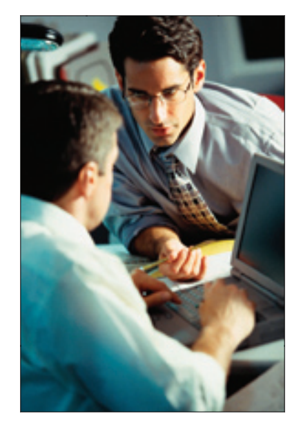
IBM engineers can take their product designs to the desktops of contract manufacturers through the company's EGI Net e-procurement application, which has been redesigned with WebSphere MQ.