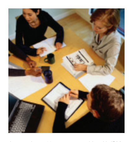
Leveraging a 20-year partnership with IBM, Geac recently formed a strategic alliance with IBM to provide e-business services and ERP software for mid-size companies.

System21 is a leading ERP system in the automotive, food, beverage and apparel industries. These sectors today are acutely affected by the volatility of their business operating environment. Companies need to react to changes quickly with enhancements and extensions to their ERP software as they adapt to changing conditions. But the middle-market companies that are the core of Geac's customer base have a strong preference for buying an integrated solution from a single supplier. They look to Geac to build new functionality into System21 and to provide integration with third-party extensions around their ERP hub.