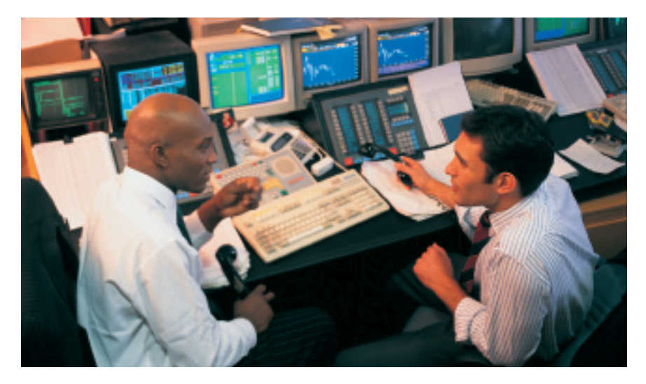
Using CommerceQuest's enableNet solution, trading exchanges can process any type of transaction to any type of device or system, including phone, fax, e-mail and even directly into an SAP ERP application through electronic data interchange (EDI).

Put aside the telephone and, for that matter, the fax machine. These days, the Internet is the channel for corporate commerce, as businesses find greater efficiency in dealing with trading partners online. And CommerceQuest, a pioneer of end-to-end business integration solutions for large enterprise and online trading communities, is taking full advantage of the popularity of the Internet. Founded in 1992 and based in Tampa, Florida, CommerceQuest has offices throughout the U.S. as well as in Europe, the Asia Pacific region and South Africa—with 300 employees striving to help its clients operate more efficiently.