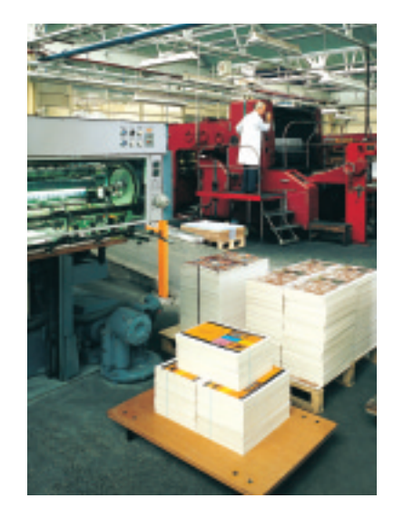
Commercial printing may be its specialty, but Gill Studios is also proving to be an expert e-business.