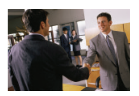
SearchStation performs consolidated searches for job candidates, making it easier for recruiters to find the ideal candidate.

Based in White River Junction, Vermont, AIRS (Advanced Internet Recruitment Strategies) has capitalized on the growth of Web-based recruitment by undertaking to train companies in the new methods and offer them tools to make searching easy, fast and successful. In addition to seminars on candidate-hunting techniques, AIRS provides companies and recruitment agencies with SearchStation, a set of targeted search tools that combs the Internet for resumes of qualified individuals and retrieves this information from public data sources, wherever they are.