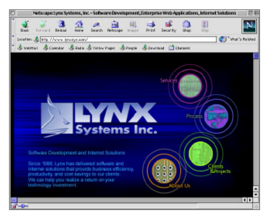
Committed to the Linux platform, AIRS sought a Web integrator that could re-architect SearchStation in re-usable, object-oriented Java technology; the company chose IBM Business Partner Lynx Systems.

The re-architected SearchStation is about to go into production, along with customized versions that AIRS is developing for OEM business partners serving Fortune 500 firms. Since AIRS' new partners reach thousands of recruiters in top-tier companies, the OEM version of SearchStation. which AIRS will sell from its own Web site, will expand its market by at least a factor of ten. Using EJBs, which isolate the business logic into granular, reusable components, AIRS and Lynx are able to specify search targets with greater exactitude and keep them up to date as sources change and move around on the Internet. The faster, more accurate search tool will save users up to 50 percent in search time. As a result, AIRS expects sales growth to soar from 50 percent to 100 percent in the first year.