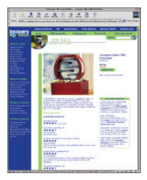
Selling gifts online that captivate the imagination calls for WebSphere Commerce Suite, a commerce engine that stirs the impulse to buy.