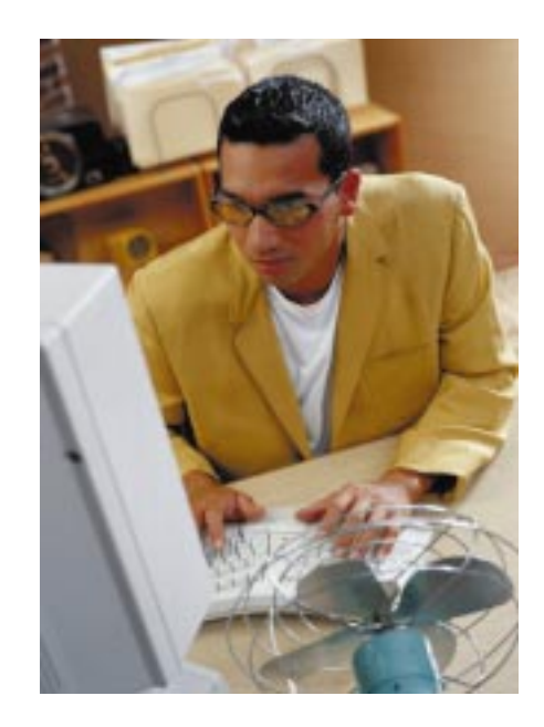
Bancolombia's product managers maintain their own areas of the virtual branch Web site using the Net.Commerce Product Advisor.