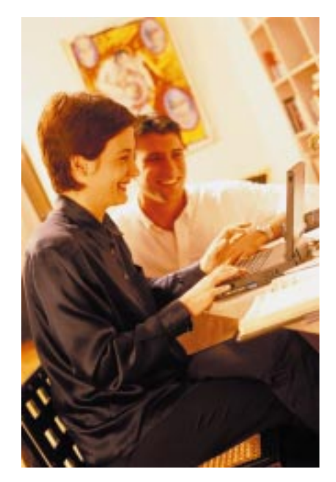
Bancolombia's convenient new servicevirtual branch banking—is catching on in Colombia.

"We also looked at Microsoft's e-commerce offerings, but we preferred IBM because we needed not only the products but also the know-how and help to complete this project on time."