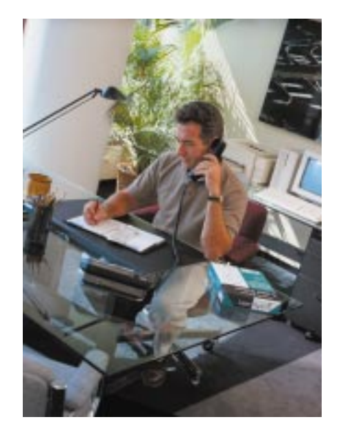
VoicePlanet.com provides mobile professionals with a fully equipped virtual office accessible around the world.