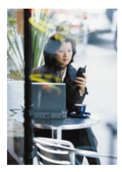
VoicePlanet.com makes communication easier by delivering integrated, realtime voice-mail, e-mail and fax services.

"Its multiplatform availability and ability to support large scale e-business applications make [the] WebSphere [family] the ideal choice for VoicePlanet.com."