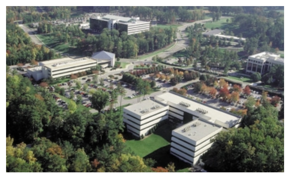
SAS Institute leads the industry in its investment in research and development. Much of this development takes place at the Institute's world headquarters in Cary, North Carolina, in the state's Research Triangle Park region.