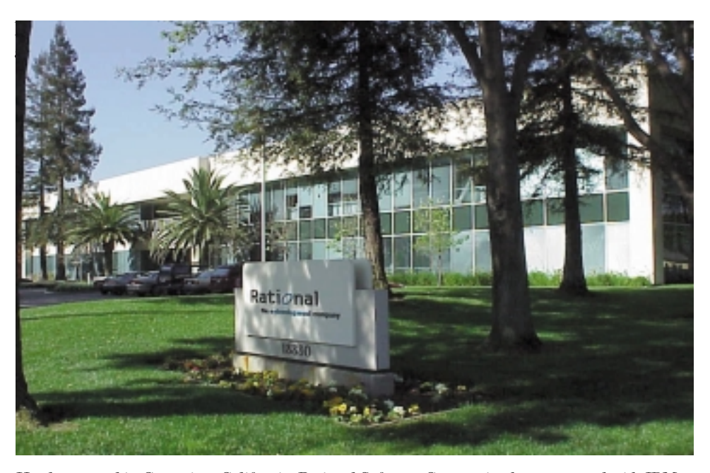
Headquartered in Cupertino, California, Rational Software Corporation has partnered with IBM to create e-business applications for the 21st century.

The close collaboration between Rational Software and IBM also ensures that developers at both companies are aware of each other's software development strategy, and more importantly, how those plans will affect the design of their own products to ultimately meet the needs of the development community for a tightly integrated development and deployment environment.