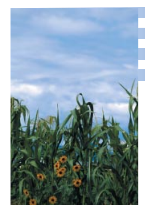
Country Insurance and Financial Services' roots reach deep into the American heartland, where farming families insured their property with the insurance group as early as 1925.