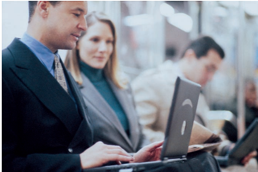
Investment Architect is a Microsoft® Windows®-based client application that runs on financial advisors' desktops or laptops.