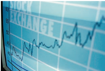
Financial advisors look to IDT for raw, quantitative managed fund data, such as unit prices, fund sizes and asset allocations.

Until recently, the only way IDT provided daily updates was through its bulletin board service (BBS), which advisors accessed through a modem connection. But the updates were scheduled for a specific 15-minute window. Advisors could not get updates at other times of the day.