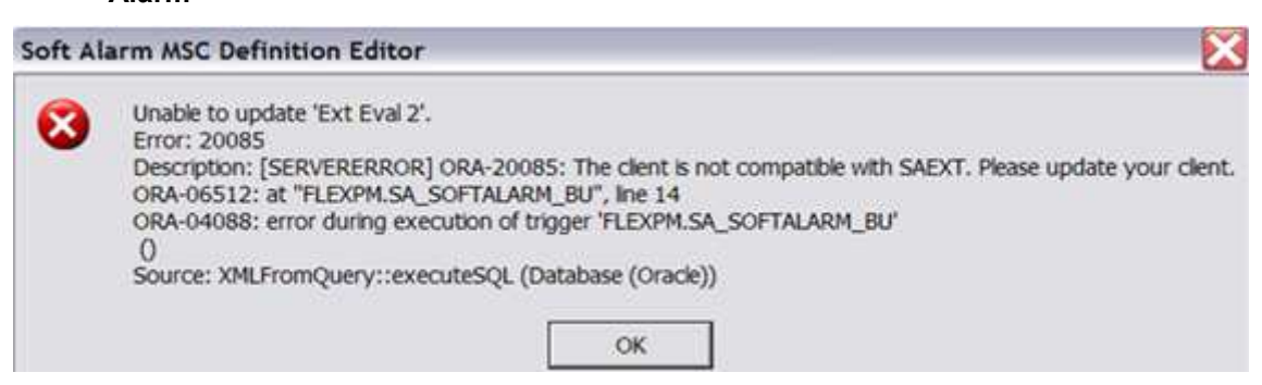
Figure 1: Message displayed when attempting to modify an existing External Soft Alarm

On the other hand, when using an older client, you can delete an existing External Soft Alarm.