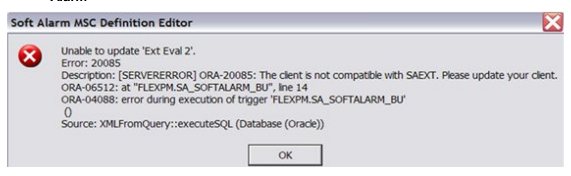
Figure 1: Message displayed when attempting to modify an existing External Soft Alarm

On the other hand, when using an older client, you can delete an existing External Soft Alarm.