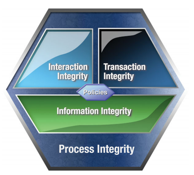
Process integrity with BPM and SOA

Process integrity is the ability to conduct reliable business activities with seamless synchronization between human tasks, services and information—an ability that must extend across the entire dynamic enterprise network, including those parts that reach beyond the boundaries of the enterprise itself. Process integrity includes automated and predictable compensation and recovery when failures occur, whether those failures are in the process itself or in the information systems that the process depends on. This leads to a deep dependency on, not only the integrity characteristics of the process execution environment, but rather the integrity characteristics of the information systems environment in general, as illustrated in the figure below: