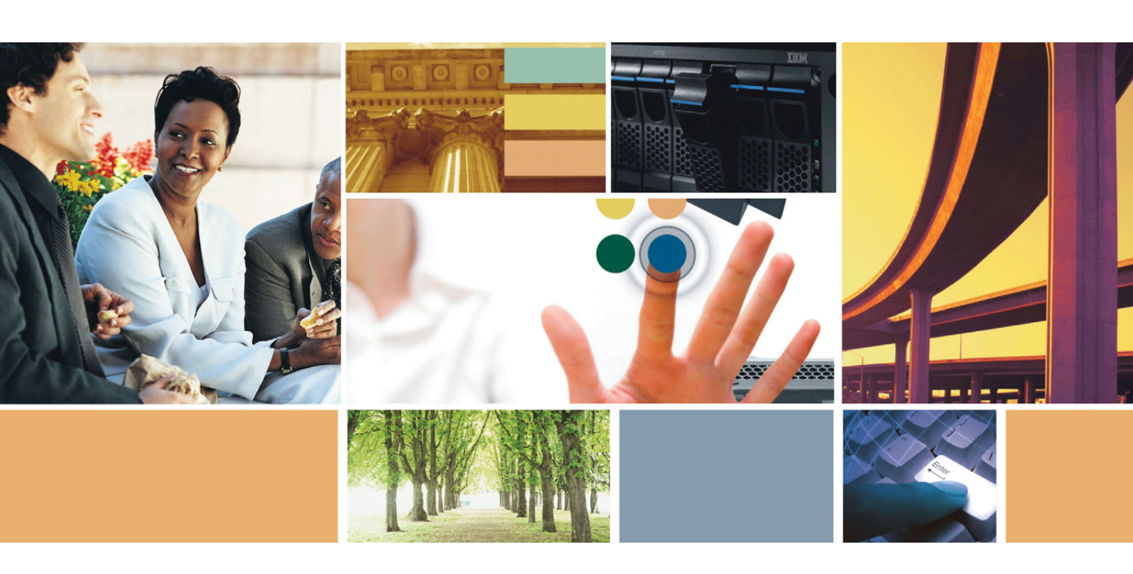
Manage storage more effectively with virtualization capabilities from IBM