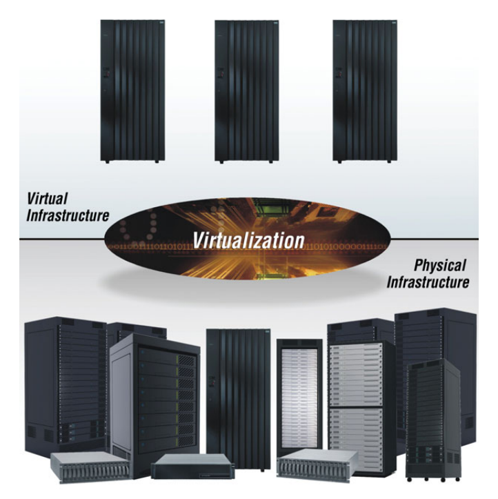
Virtualization hides the true complexity of the storage environment from the servers and applications in the data center.

The alternative is a virtualized approach in which storage virtualization software presents a "view" of storage resources to servers that is different from the actual physical hardware in use. This logical view can hide undesirable characteristics of storage while presenting storage in a more convenient manner for applications. For example, storage virtualization may present storage capacity as a consolidated whole, hiding the actual physical boxes that contain the storage. In this way storage becomes a logical pool of resources that exists virtually, regardless of where the actual physical storage resources are located in the larger information infrastructure. These software-defined virtual resources are easier and less disruptive to change and manage than hardware-based physical storage devices, since they don't involve moving equipment or making physical connections. As a result, they can respond more flexibly and dynamically to changing business needs. Similarly, the flexibility afforded by virtual resources makes it easier to match storage to business requirements.