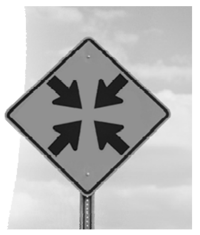
"We are taking apart each task and sending it...to whomever can do it best...and then we are reassembling all the pieces."

from Thomas Friedman's 'The World is Flat'