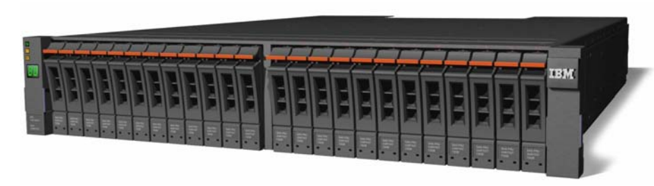
Exhibit 1 — IBM's Modular Hardware Building Blocks