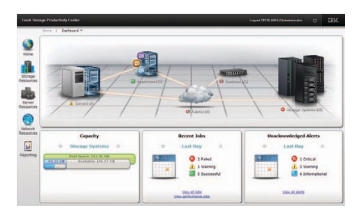
The fully-integrated, web-based user interface

Tivoli Storage Productivity Center provides device-level, integrated storage infrastructure management capabilities for managing both IBM System Storage® products and other vendors' storage systems. It is by design that Tivoli Storage Productivity