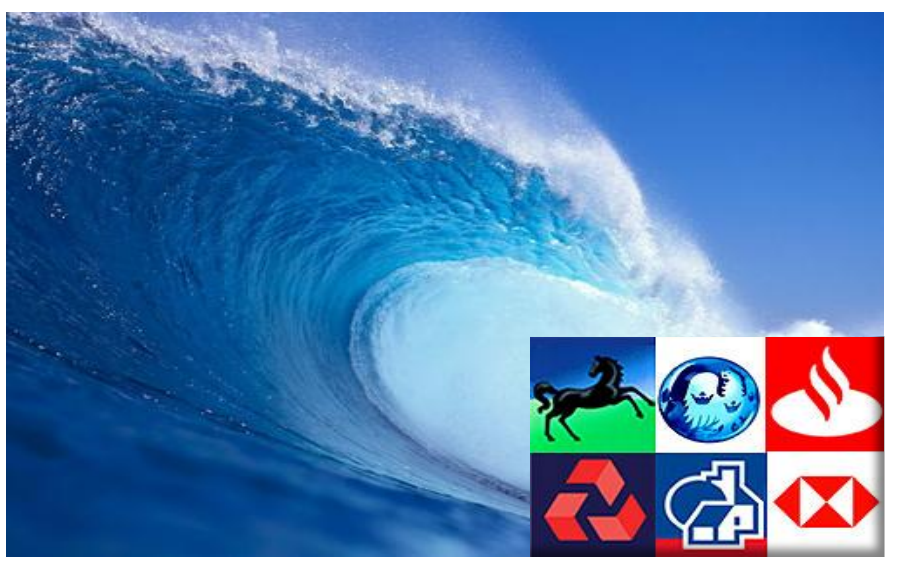
THE TIDALWAVE OF REGULATORY CHANGE