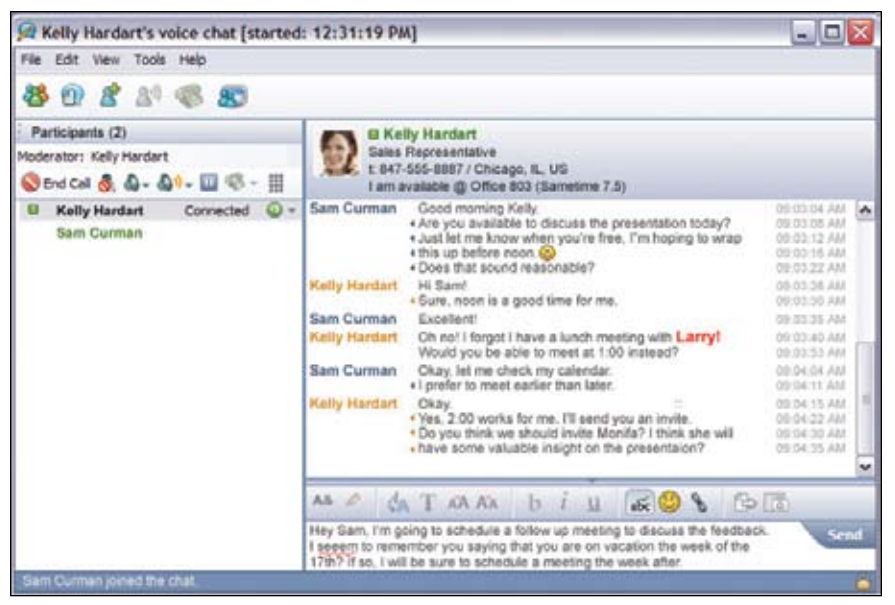
VoIP technology embedded within IBM Lotus Sametime 7.5 software provides the opportunity to engage in high-quality, bandwidth-efficient, real-time voice communications.