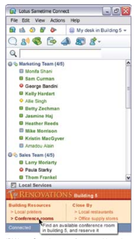
IBM Lotus Sametime 7.5 software provides collaboration capabilities such as voice chat and access to public and enterprise IM networks—all from a single interface.

A comprehensive instant messaging (IM) and Web conferencing solution, Lotus Sametime 7.5 software provides the communication and collaboration tools you need to run your business in real time. Built-in security features allow you to reliably exchange confidential business information—and you can be confident that only your intended recipient will have access to it and that your recipient's identity has been verified. And Lotus Sametime software is designed to integrate with your existing IT environment, providing significant cost savings and a consistent technology approach across your entire enterprise.