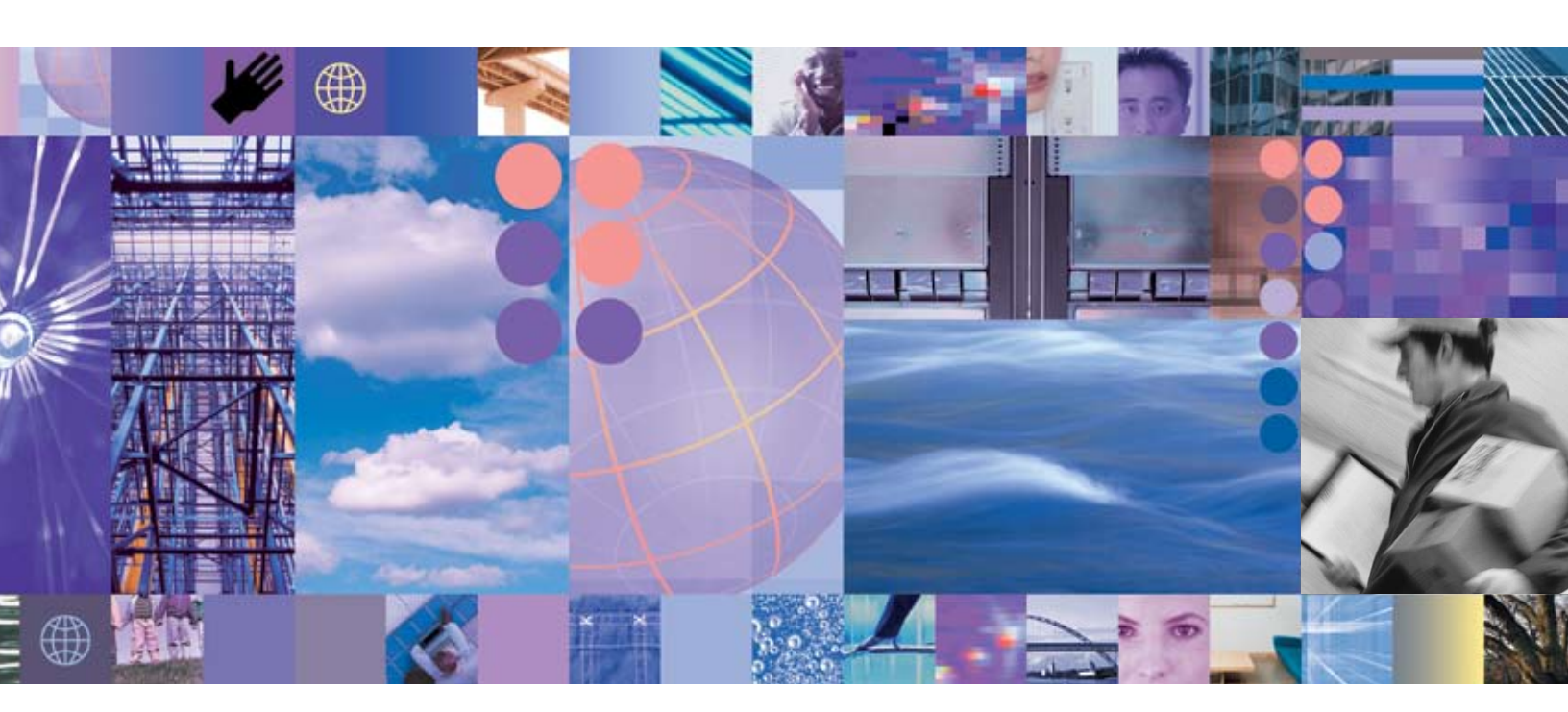
Using SOA to optimize business event processing.