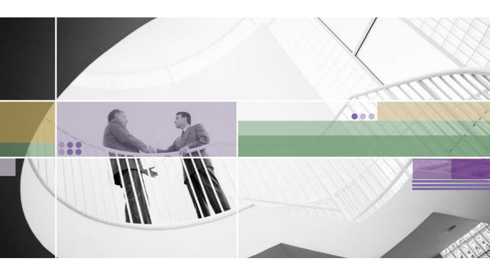
Making business better: business process management with SOA

Facilitating innovation through improved productivity