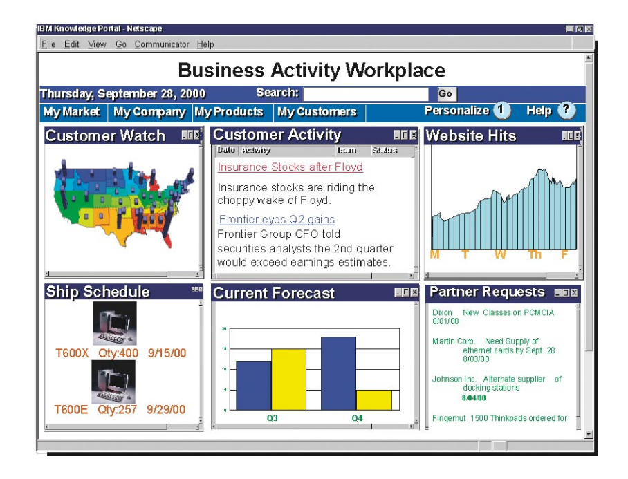
Figure 1. Business activity workplaces display business results.

Business activity workplaces must also accommodate the needs of specific industries. IBM software supports key industries, and IBM is working with its Business Partners to help develop industry business activity workplaces.