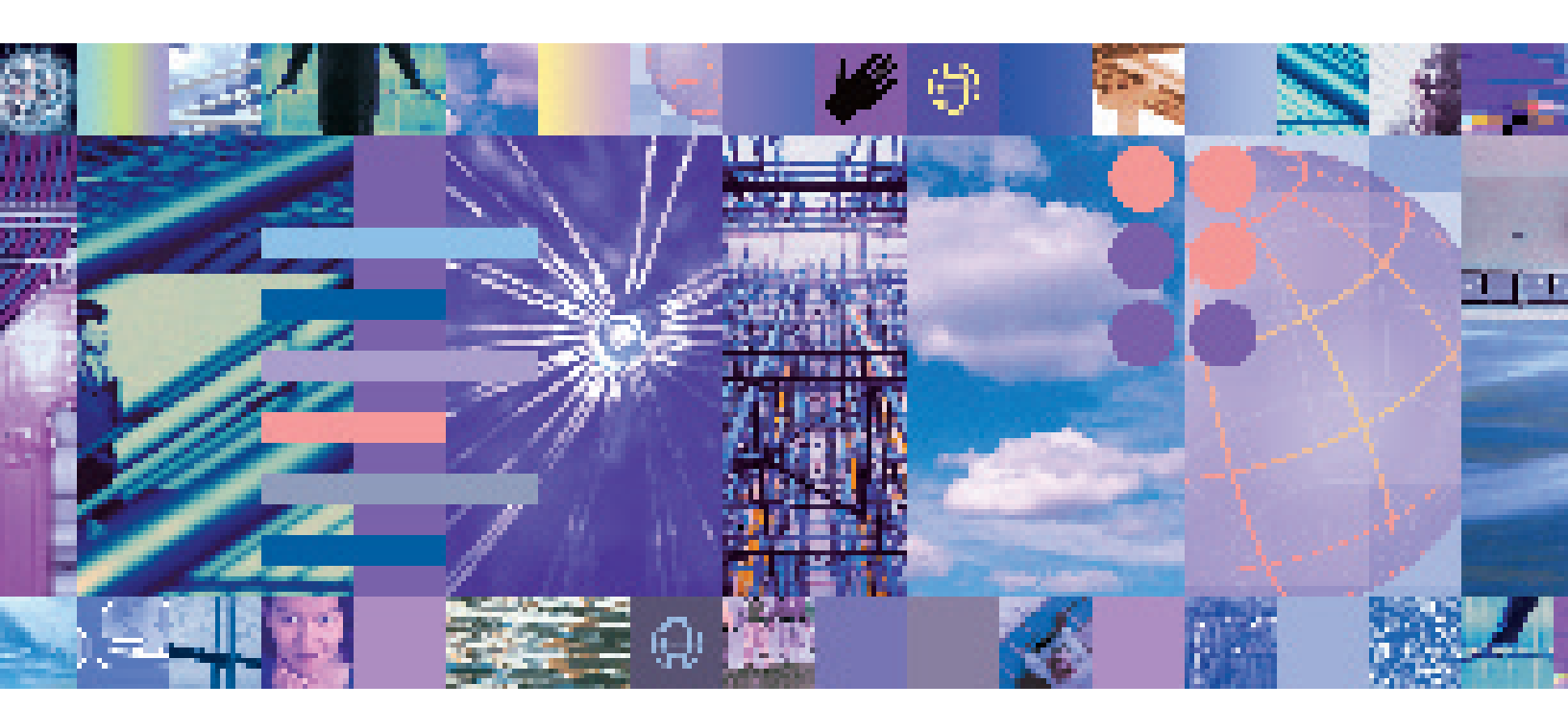
IBM WebSphere Business Integration for Electronics