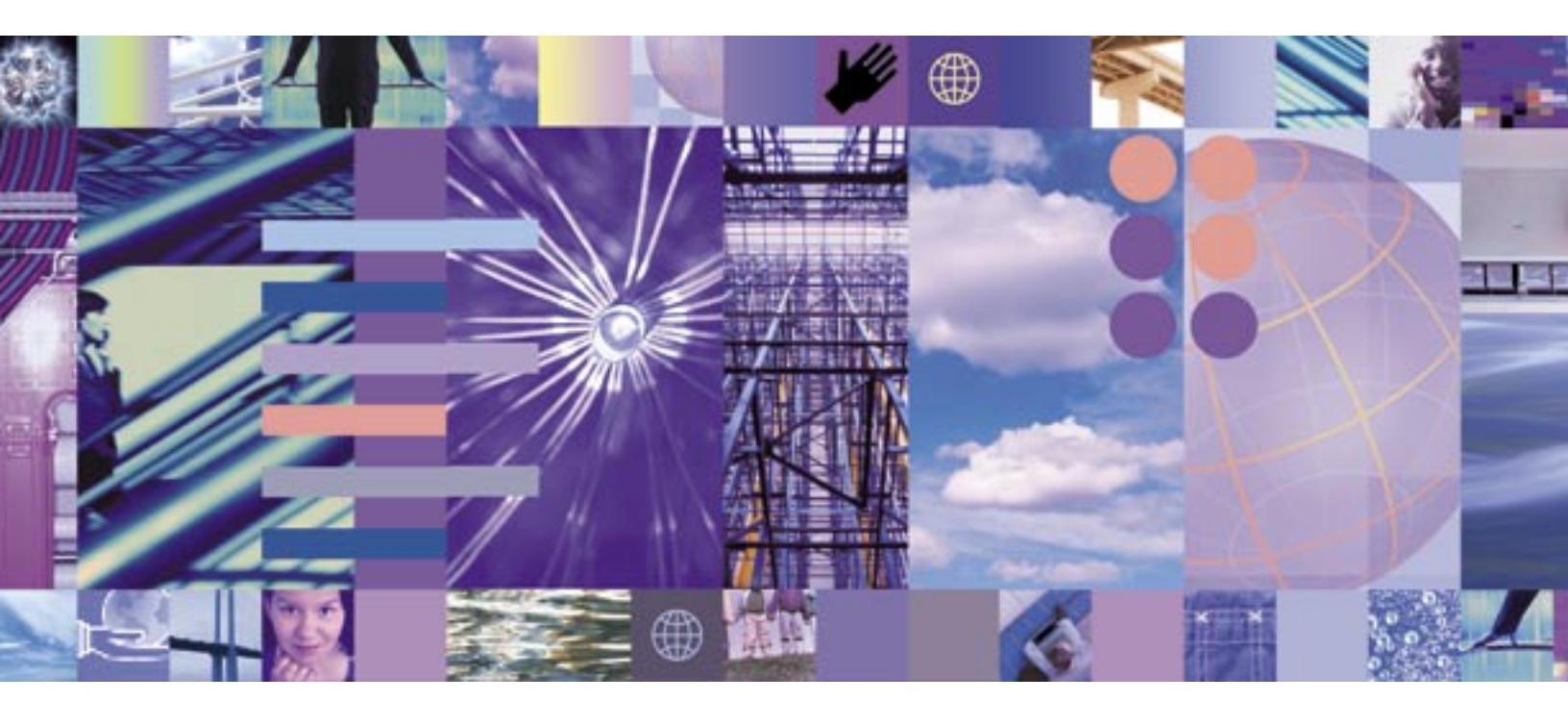
IBM WebSphere Business Integration for Electronics