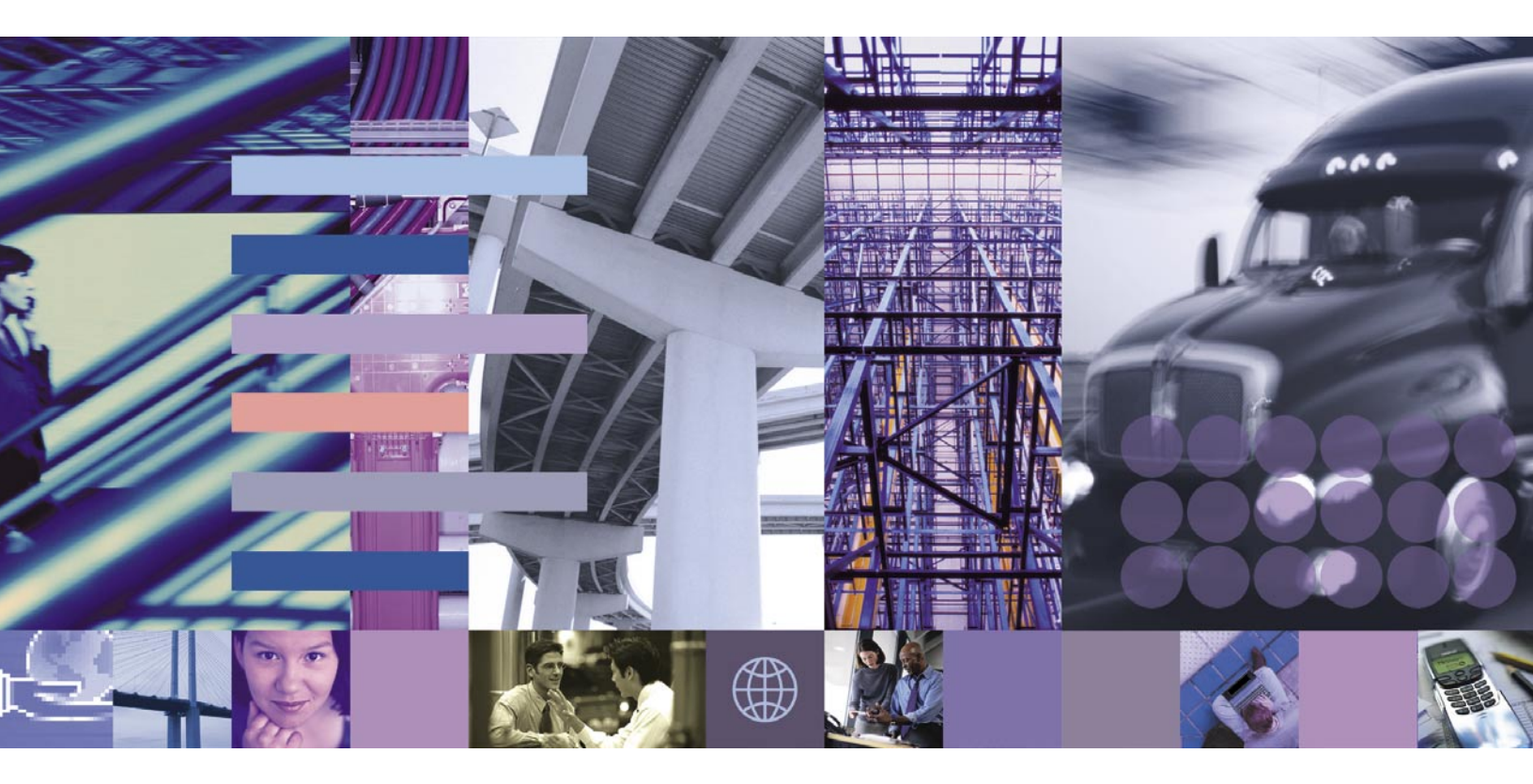
Software solutions to help integrate the extended enterprise.