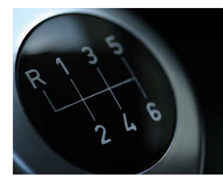
Keeping our clients in the race IBM Data Center Services