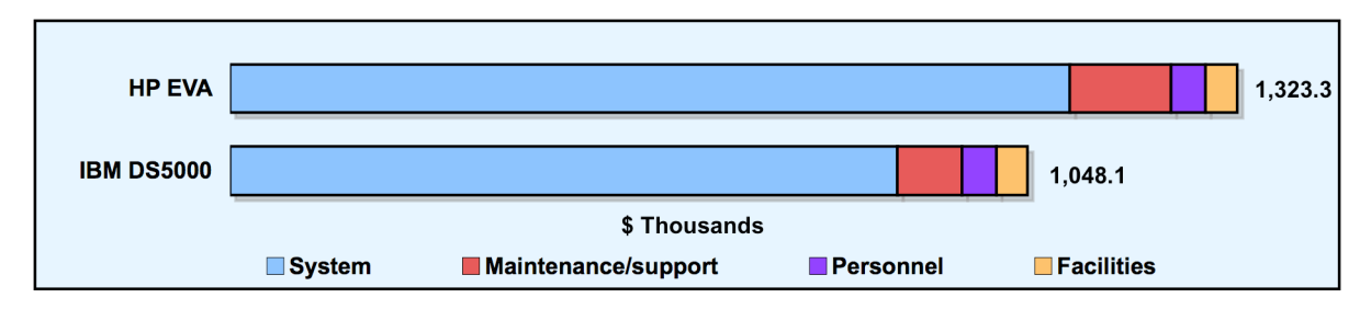
Figure 2 Comparison of Three-year Costs for HP EVA and IBM DS5000 Systems: Averages for All Installations

As figure 2 shows, costs for DS5000 systems averaged 21 percent less than those of EVA equivalents.