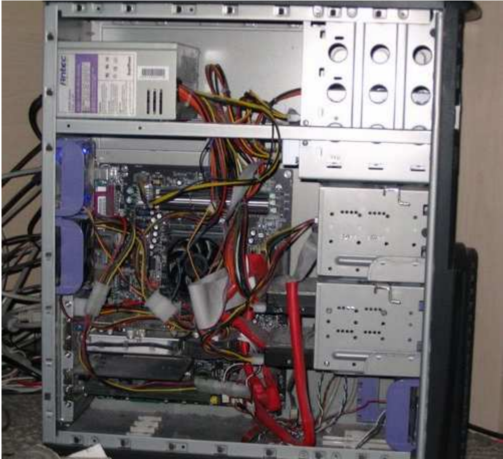
Self-made AMD Athlon 64 3000+