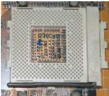
☞ An example of a CPU socket, Socket A

As installation of the different makes of CPU can differ between brands, it is generally safer to refer to the manufacturer's instructions, that are provided with the CPU. If you are using a thermal paste with your CPU, follow the directions that came with them for details on how to apply it.