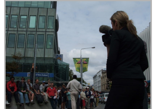
One News arrives at the scene.