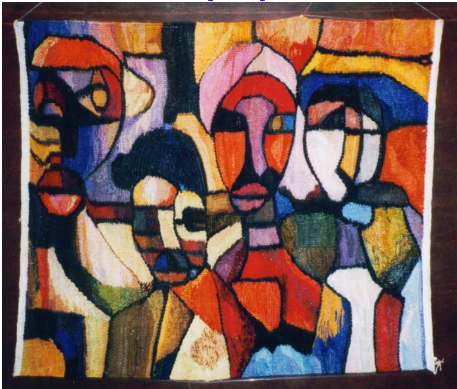
Visual Arts — handicraft (South Africa)

Theme «Revitalising Endangered Traditions»