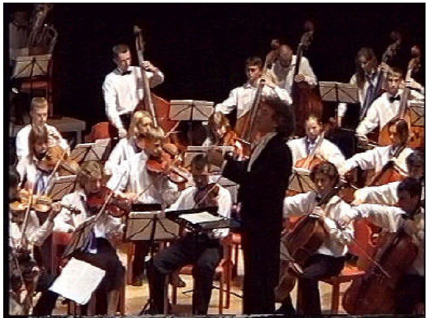
Acoustic Arts – instrumental music (Belarus)