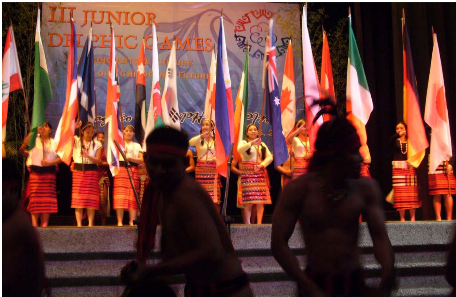
Performing Arts — Gala opening (Philippines)

Theme «Building Bridges with Arts & Culture for our Children's future»