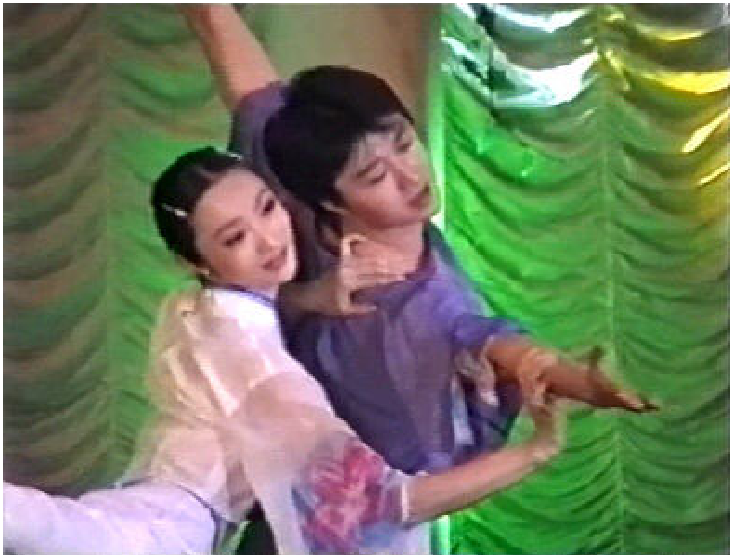
Performing Arts – Dance (China)