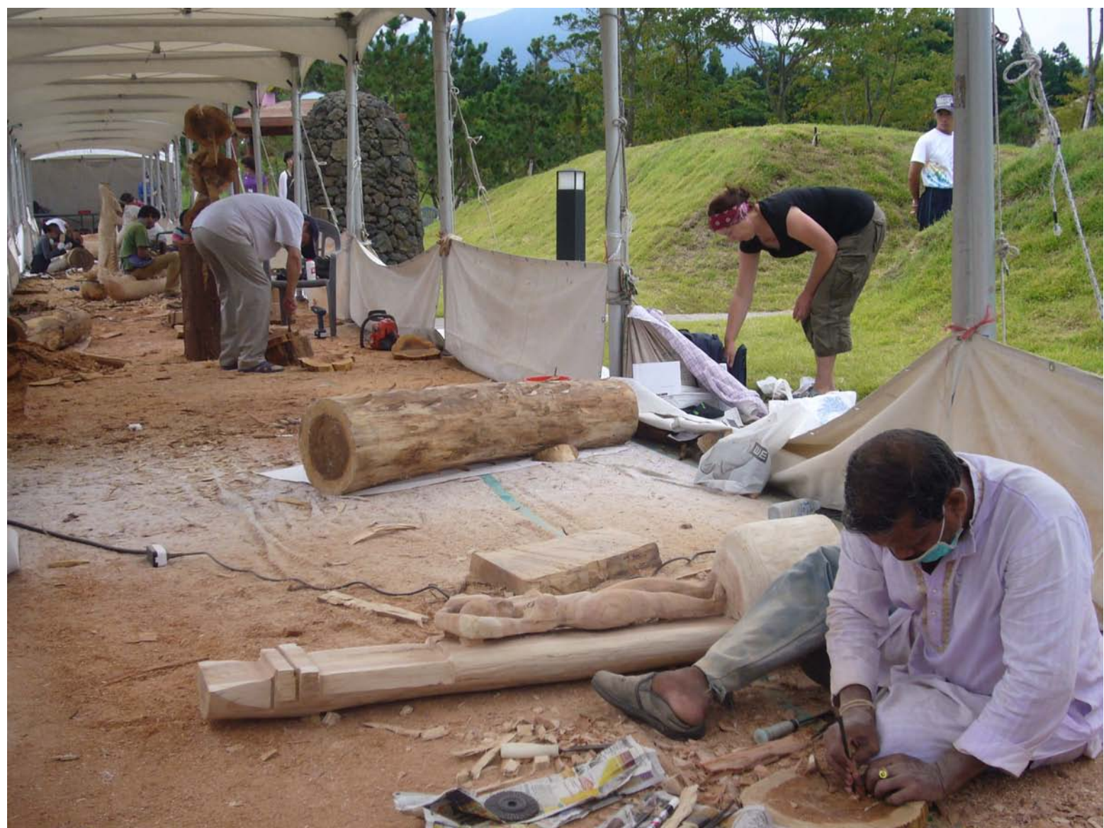
Visual Arts — sculpture (members of various delegations)