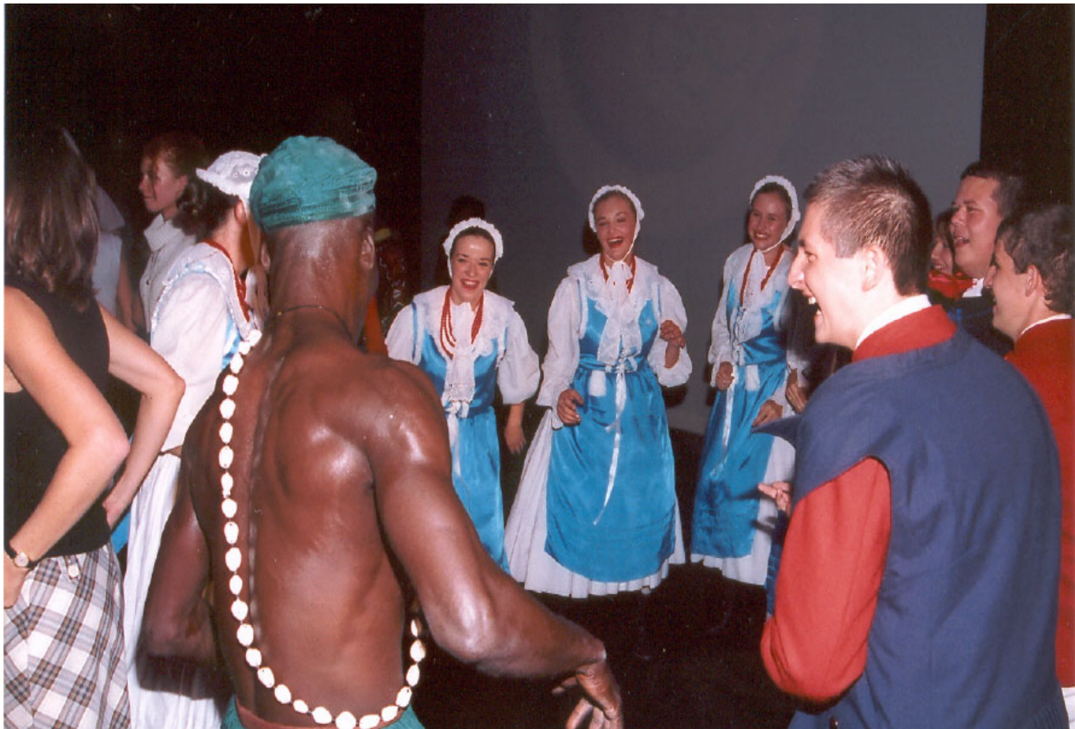
Social Arts – communication, informal meeting of various delegations