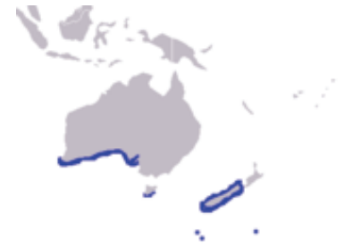
Distribution of New Zealand Fur Seals

There was a rush for seals in Dusky Sound and the West Coast in the early nineteenth century, and the seals were hunted to the verge of extinction by 1830. Sealing in New Zealand was finally outlawed in 1926.