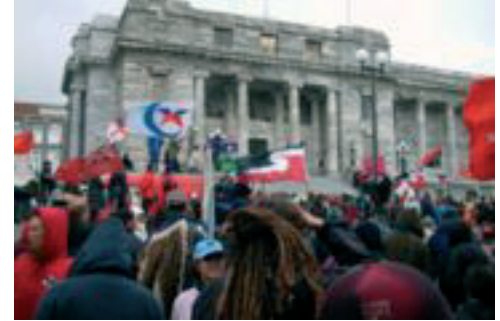
A protest outside the New Zealand Parliament over the foreshore and seabed controversy.

The New Zealand public were surprised and shocked by the claim to the beaches. The Prime Minister, Helen Clark, said that the Government would be passing law to ensure that beaches remained in public hands. However, the law incorporated Maori being consulted over foreshore and seabed matters. Due to this, the Labour Party was heavily attacked by National Party leader, Don Brash, who said the Government showed favouritism towards Maoris. Soon afterwards National was ahead of Labour in an opinion poll.