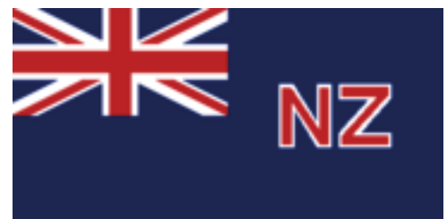
The Colonial New Zealand flag

The first capital of the country was Russell, located the Bay of Islands, declared by Governor Hobson after New Zealand was formally annexed. In September 1840, Hobson changed the capital to the shores of the Waitematā Harbour where Auckland was founded. The seat of Government was centralised in Wellington by 1865.