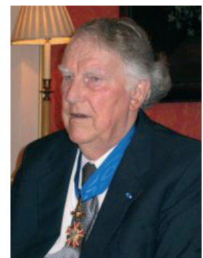
Sir Edmund Hillary in Poland, 2004.

Edmund Hillary is one of the most famous New Zealanders, and appears on the New Zealand five dollar note.