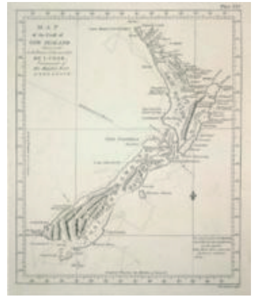
First map of New Zealand, drawn by James Cook.

He returned to New Zealand another two times in the 18th Century.