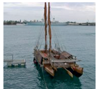
A replica Polynesian canoe Hawai'iloa in Honolulu harbour

For a long time during the nineteenth and twentieth centuries, it was believed the first inhabitants of New Zealand were the Moriori people, who hunted giant birds called moas. The theory then established the idea that the Maori people migrated from Polynesia in a Great Fleet and took New Zealand from the Morioris, establishing an agricultural society. However, new evidence suggests that the Morioris were a group of mainland Maori who migrated from New Zealand to the Chatham Islands, developing their own distinctive, peaceful culture.