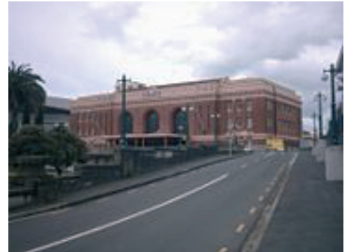
The old Auckland Railway Station

After the abolition of Provincial Governments in 1876, the Central Government took over the building of railways in New Zealand.