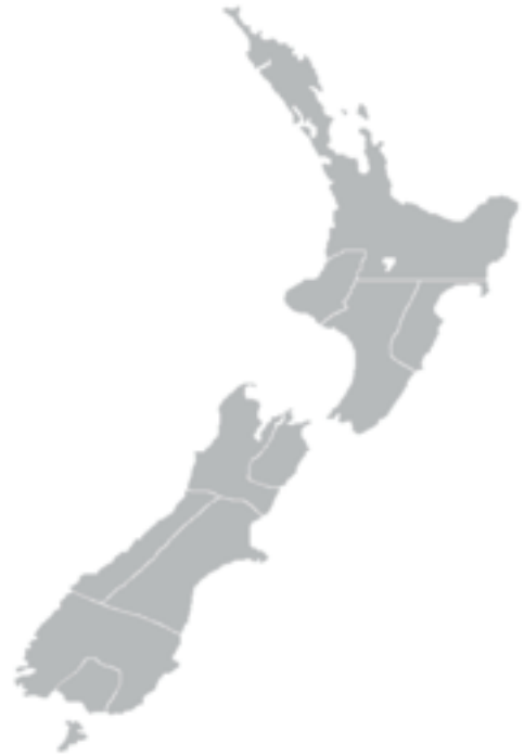
The boundaries of the former New Zealand provinces

Not long after they had begun, Provincial Governments were under political debate in the General Assembly. Eventually, under the premiership of Harry Atkinson, the Colonial Government passed the Abolition of Provinces Act 1876 which wiped out the Provincial Governments, replacing them with regions. Provinces finally ceased to exist on the 1st of January 1877.