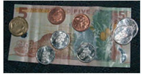
Current New Zealand coins and five dollar note under the decimal currency.

The first decimal coins were introduced on the 10th of July 1967.