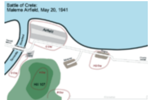
Map showing the positions of the New Zealand 2nd Division in the Battle of Crete.

New Zealand participated in the war until its end in 1945.