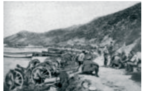
Troops on the Gallipoli shore after the first battle.

New Zealand's first act in the war was to seize German Samoa. New Zealand sent 1,413 men to conduct this action and took control of the territory without much resistance. It was the first German territory to be occupied in the name of King George V in the war.