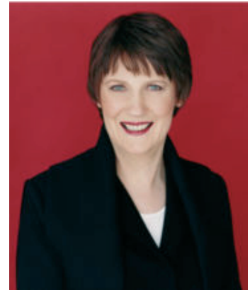
The Rt. Hon. Helen Clark

In March 2003, referring to the U.S. led coalition's actions in the Iraq War, Clark told the newspaper Sunday Star Times; "I don't think that September 11 under a Gore presidency would have had this consequence for Iraq." She subsequently sent a letter to Washington apologising for any offence that her comment may have caused.