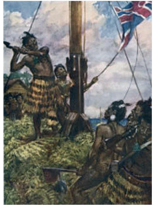
Hone Heke cutting down the British flagstaff at Kororareka.

The Ngati Ruanui tribe, which had been helping other tribes in the North Taranaki War, returned to Southern Taranaki after the war, and attacked Tataraimaka in 1863. The British Army were sent into the area to control the Maori. The British Army were eventually replaced by the New Zealand Armed Constabulary, so the British Army could return home to England.