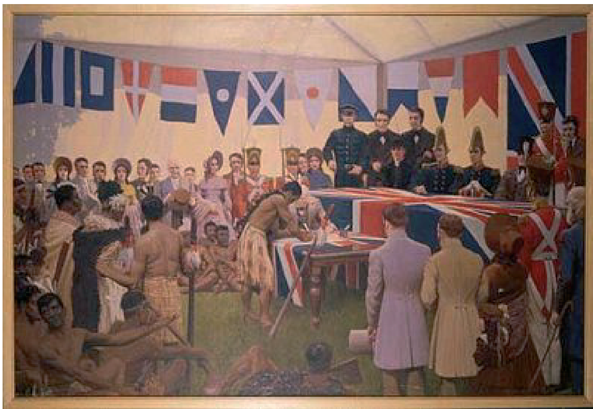
The Treaty at Waitangi 1840