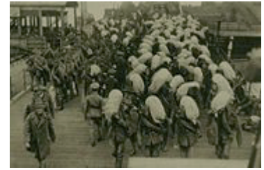
New Zealand troops unloading at a French port

On the 25th of April 1915, New Zealand sent troops to Gallipoli with Australian soldiers to help seize Constantinople, under the command of British General, Alexander Godly. Due to a navigational error, however, they landed at the wrong point, and the steep cliffs in the cove they had disembarked at offered the Turkish defenders a significant vantage point. Advancement of the New Zealand-Australian forces was impossible. New Zealand suffered casualties of 2,721 dead and 4,852 wounded in the cove, and eventually it was decided to evacuate. The battle was the first great conflict of New Zealand, and the loss was felt greatly in New Zealand.