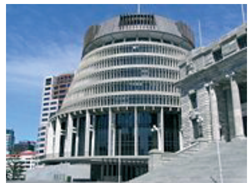
The New Zealand Parliament House and Beehive Building.

The Labour Party has been the only political party to govern New Zealand in the twenty first century, after winning the 1999, 2002 and 2005 elections.