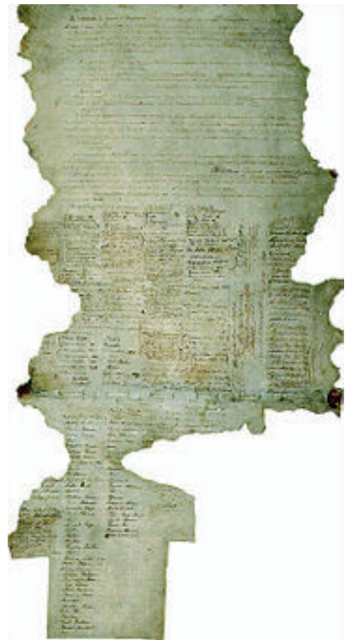
An original English version of the Treaty of Waitangi.

Article the second Her Majesty the Queen of England confirms and guarantees to the Chiefs and Tribes of New Zealand and to the respective families and individuals thereof the full exclusive and undisturbed possession of their Lands and Estates Forests Fisheries and other properties which they may collectively or individually possess so long as it is their wish and desire to retain the same in their possession; but the Chiefs of the United Tribes and the individual Chiefs yield to Her Majesty the exclusive right of Preemption