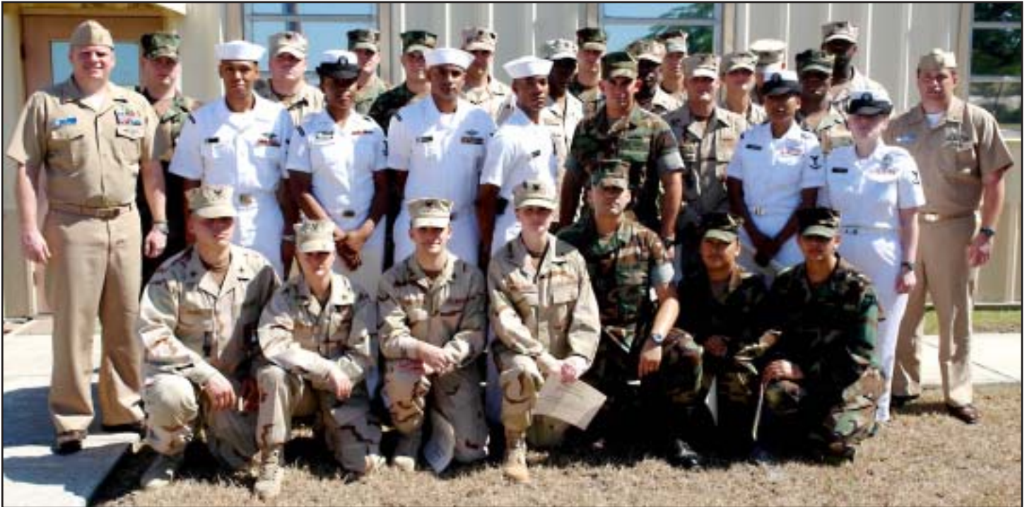
ABOVE: NAVLEAD — Petty officers from several Guantanamo Bay commands attended a week-long work center supervisor course facilitated by Sailors from the Center for Naval Leadership (CNL). The course, which allows students to interact with instructors and each other during scenario driven exercises, is one of several leadership classes CNL offers. The Navy recently mandated that the Work Center Supervisor course be completed by all E-6 examination candidates prior to testing.