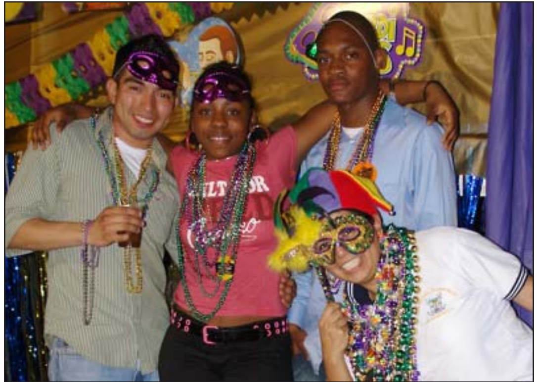
The GTMO Mardi Gras celebration Feb. 9 brought residents from all departments together to experience a taste of the Big Easy.