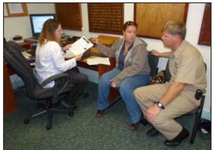
MIDDLE LEFT, BOTTOM RIGHT: TAX$$TIME — Two servicemembers and their wives prepare their 2007 income tax returns at the NLSO GTMO VITA tax center. Volunteers from the GTMO community spend countless hours per week throughout tax season preparing returns for local residents free of charge. Residents may schedule an appointment to have their taxes prepared by calling 4692.