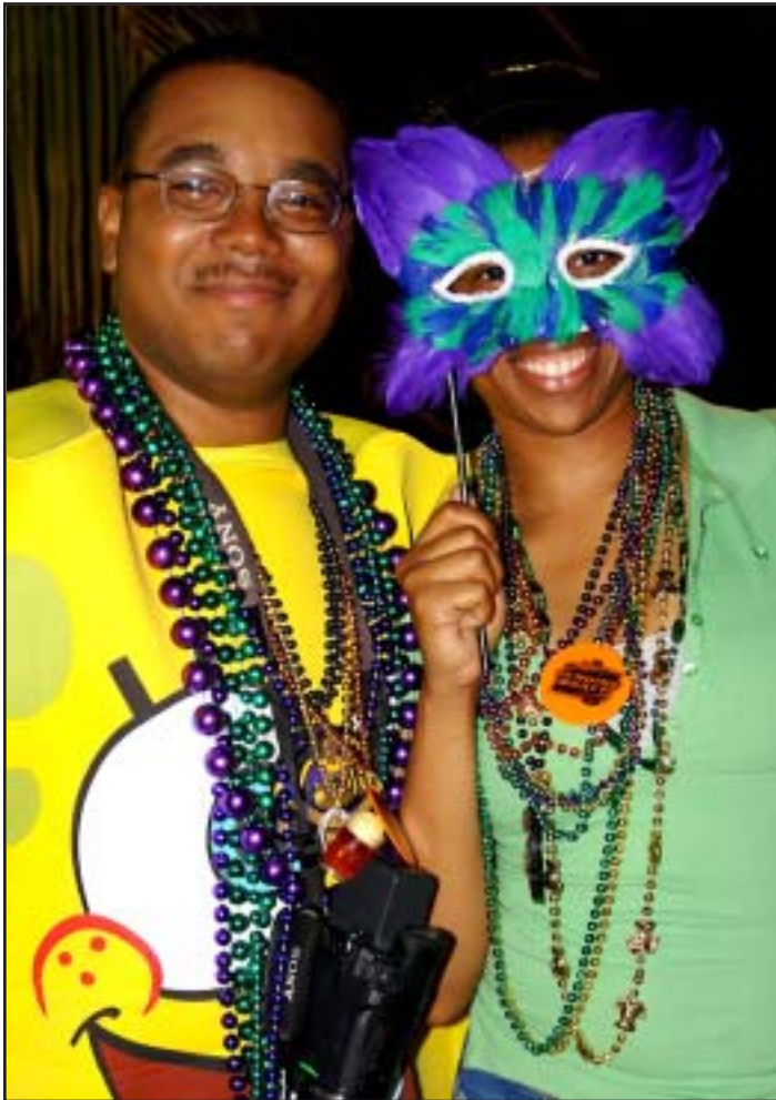
Colorful beads, medallions and feathered masks, like those shown here, are commonplace at the New Orleans Mardi Gras celebration and were also popular at the GTMO celebration Feb. 9.