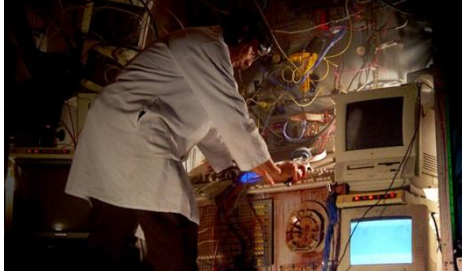
Fig. 4: Crazy scientist

Erebus tends to change their key effects from year to year, but their main theme stays the same. In the beginning of the show, patrons are sent through time by a crazy scientist where they experience almost 12 feet long giant centipede like monster. Patrons pass through many different