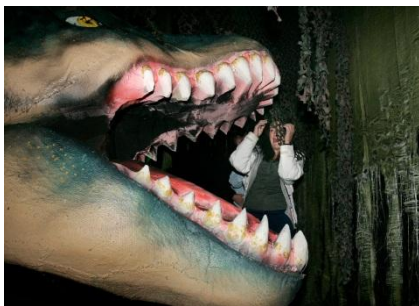
Figure 6: Dragon's mouth

bottomless pit. In one of the main events, a 6 foot dragon mouth emerges from the gloom and eats the patrons as well as dragging them screaming into the darkness [3].