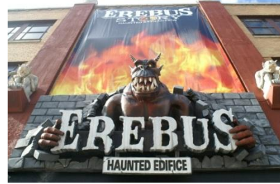
Fig. 1: Logo of Erebus Haunted House.

The haunted attraction has a wide variety of props, obstacles, chambers and special effects. This haunted attraction has gained a lot of popularity due to its extravagant nature. Erebus has a lot of resources, tools and manpower, which contributes to its popularity.