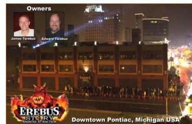
Fig. 3: Erebus Haunted House owners