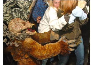
Fig. 5: Attacking monkey

Erebus haunted house also have attractions like elevator Gags, Pepper's Ghost, drop panels and a massive Tesla Coil. They always add new scenes each year such as last year they buried patrons alive in a pit. These entire attractions make Erebus haunted house into a very interesting and scary place. The actors along the walkthrough push the boundaries of privacy and how to "touch" the visitors without actually laying a hand on anyone by using other creative techniques [8].