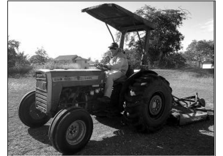
Emanlahatz mans a high-speed lawn mower pulled by an oversized tractor across the rugged terrain during his effort to make the land near Nob Hill nice.