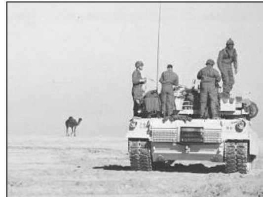
A tank rolls across the desert during Operation Desert Storm.

"I saw a lot of people die in Vietnam," said Wilbanks. "I saw a lot of people do heroic things that they would normally never do in