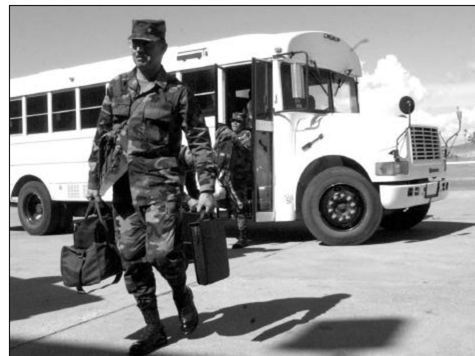
A sight for sore eyes: Members of the 240th MP Co. out of Puerto Rico arrive last week at McCalla Hanger — which means that the 114th MPs can now be assured that their passage home to Mississippi is imminent.

This is GTMO's own "Circle of Life." The 342nd MPs, after more than their half-year share of flying detainees in and guarding them in Camp Delta between flights, took their own plane home to Ohio on Tuesday and passed their mission on to the 984th out of Ft. Carson, Colorado. Next week the 239th ends their own year in active-duty boots (before GTMO, it was six months holding down