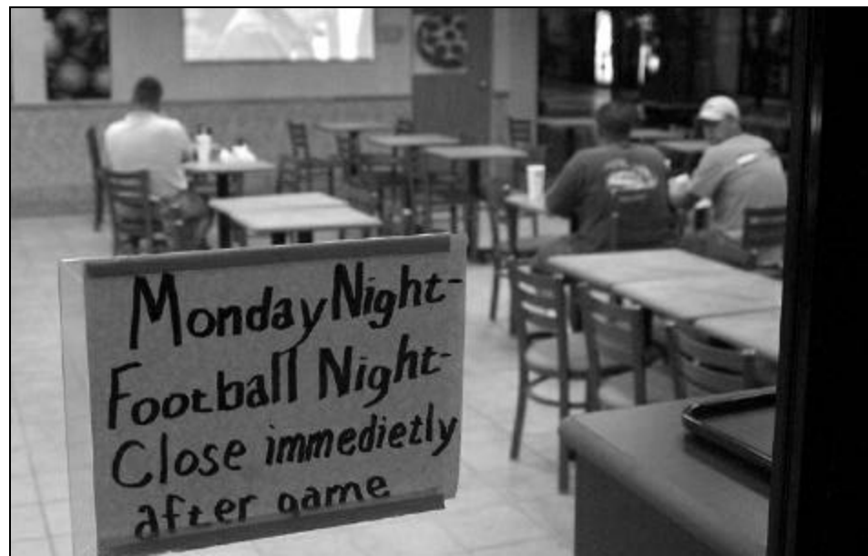
The only publicity at all for Subway's after-hours football action hangs on the door as three patrons settle in.

Those not in the know tonight are also missing a tight, eventful game. The Rams, 5-0 after an 0-5 start, are taking on the bad-news 2-7 Bears, but those expecting a rout (including the Rams, no doubt) are getting treated to a close-fought affair. After a too-easy opening-drive touchdown by the Marc Bulger-led Rams and a subsequent drive that also seemed destined for six, the Bears strip Bulger for a fumble and knock him out with a sprained index finger in the same play. After a Bears field goal, Kurt Warner is harried and