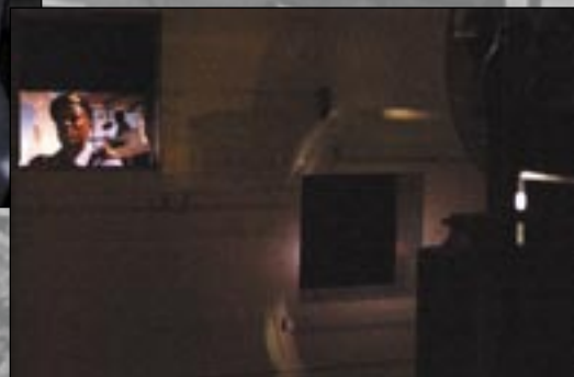
▲► The projector is located in the projection room and requires manual loading and unloading of the films that are viewed in the theatre.

movie s mak- projec- adjusts ut. The ) watts. playing lm in a