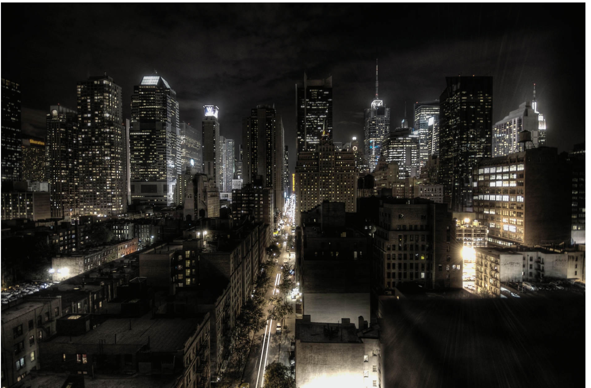
New York City at night, photographed using the High Dynamic Range technique

Paulo Barcellos Jr. on Flickr Second place, 2007 CC BY-SA 2.0