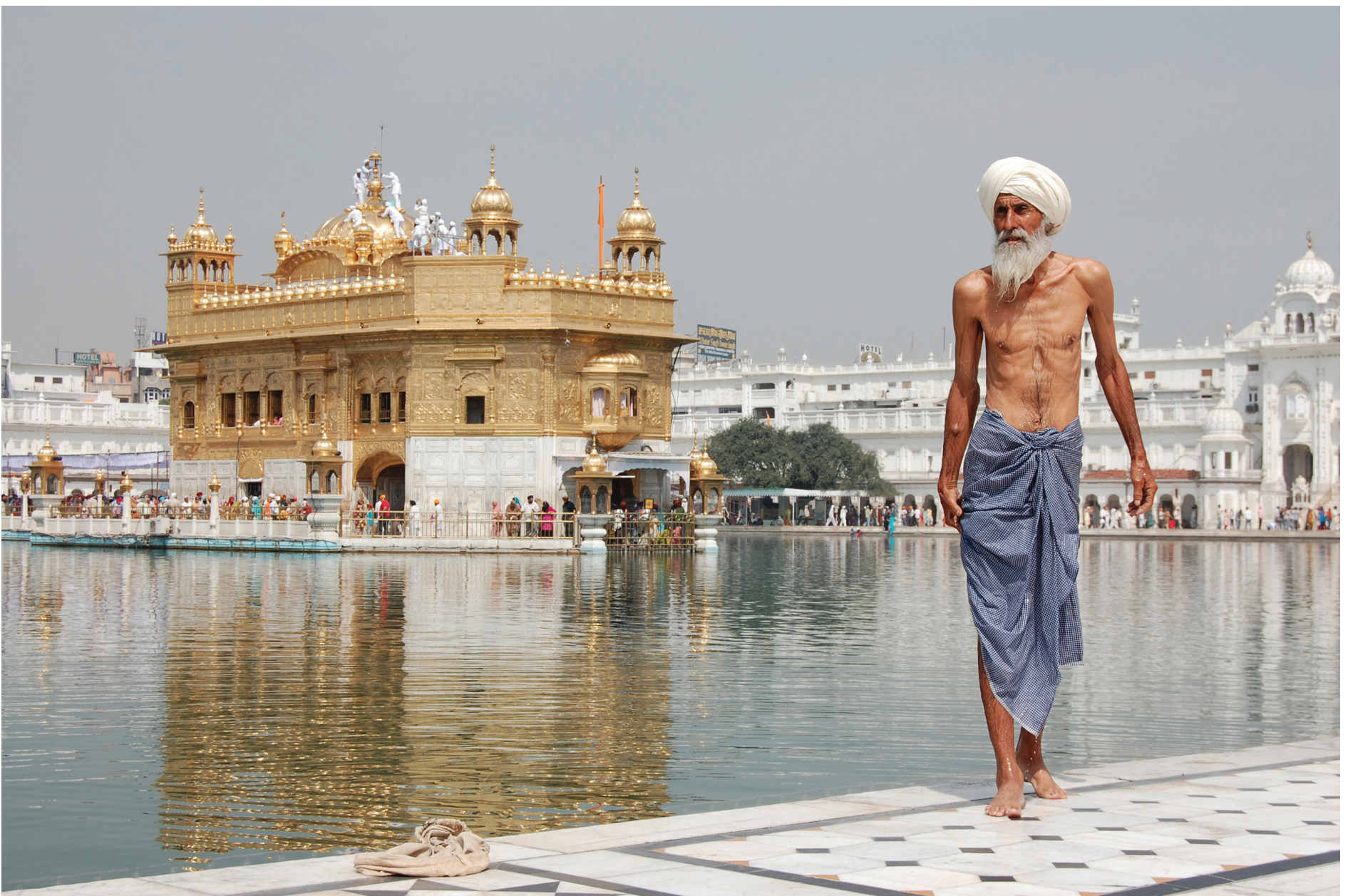
Sikh pilgrim at the Harmandir Sahib (Golden Temple) in Amritsar, India. The man has just had a ritual bath.