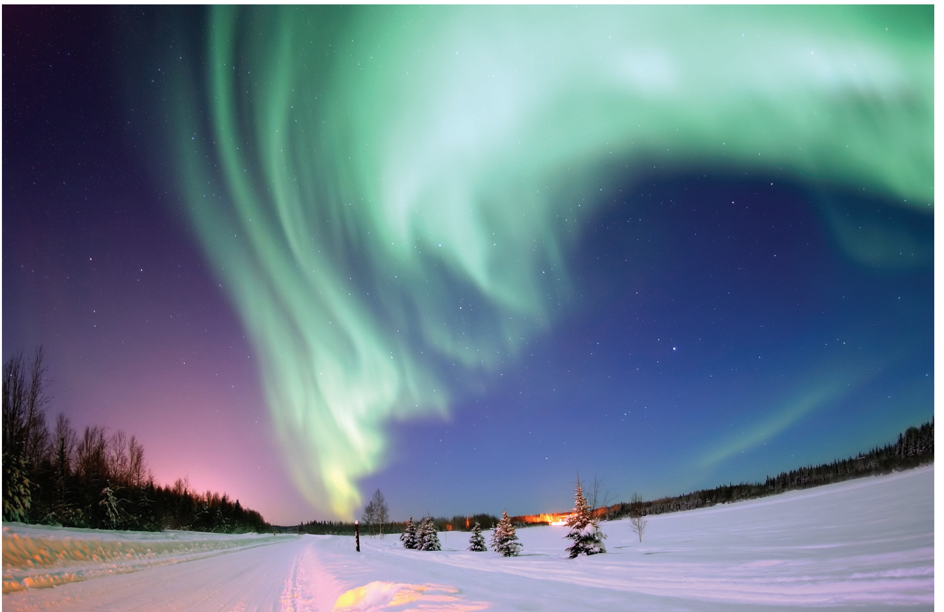
The Aurora Borealis, or Northern Lights, shines above Bear Lake, Eielson Air Force Base, Alaska