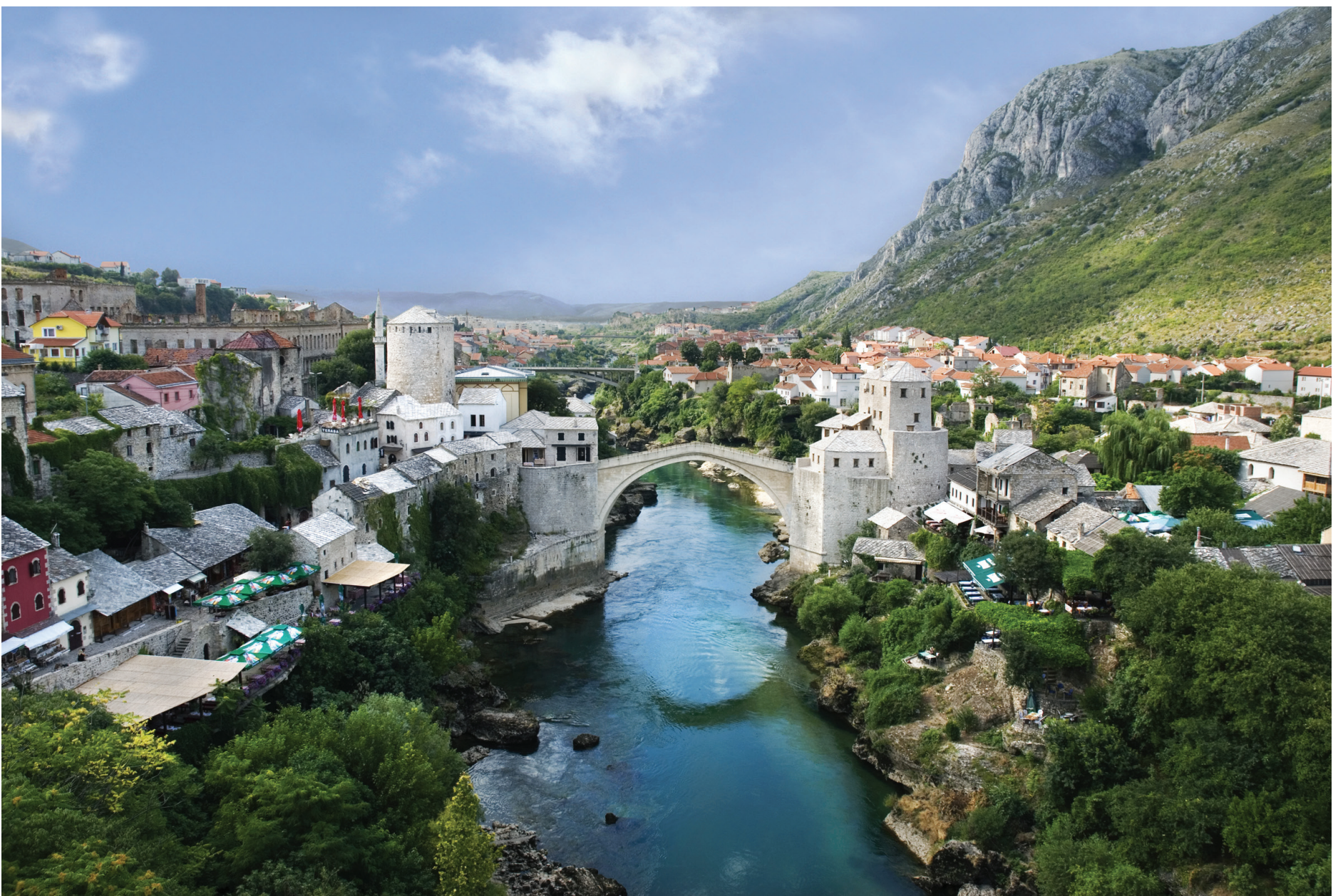
Mostar, Bosnia and Herzegovina - Old Town panorama. The picture was taken from the minaret of Koski Mehmed Pasha Mosque, which is just opposite Stari Most ("The Old Bridge") looking on the same part of the Neretva river.

User:Ramirez Second place, 2010 CC-BY-SA 3.0 and GFDL 1.2+