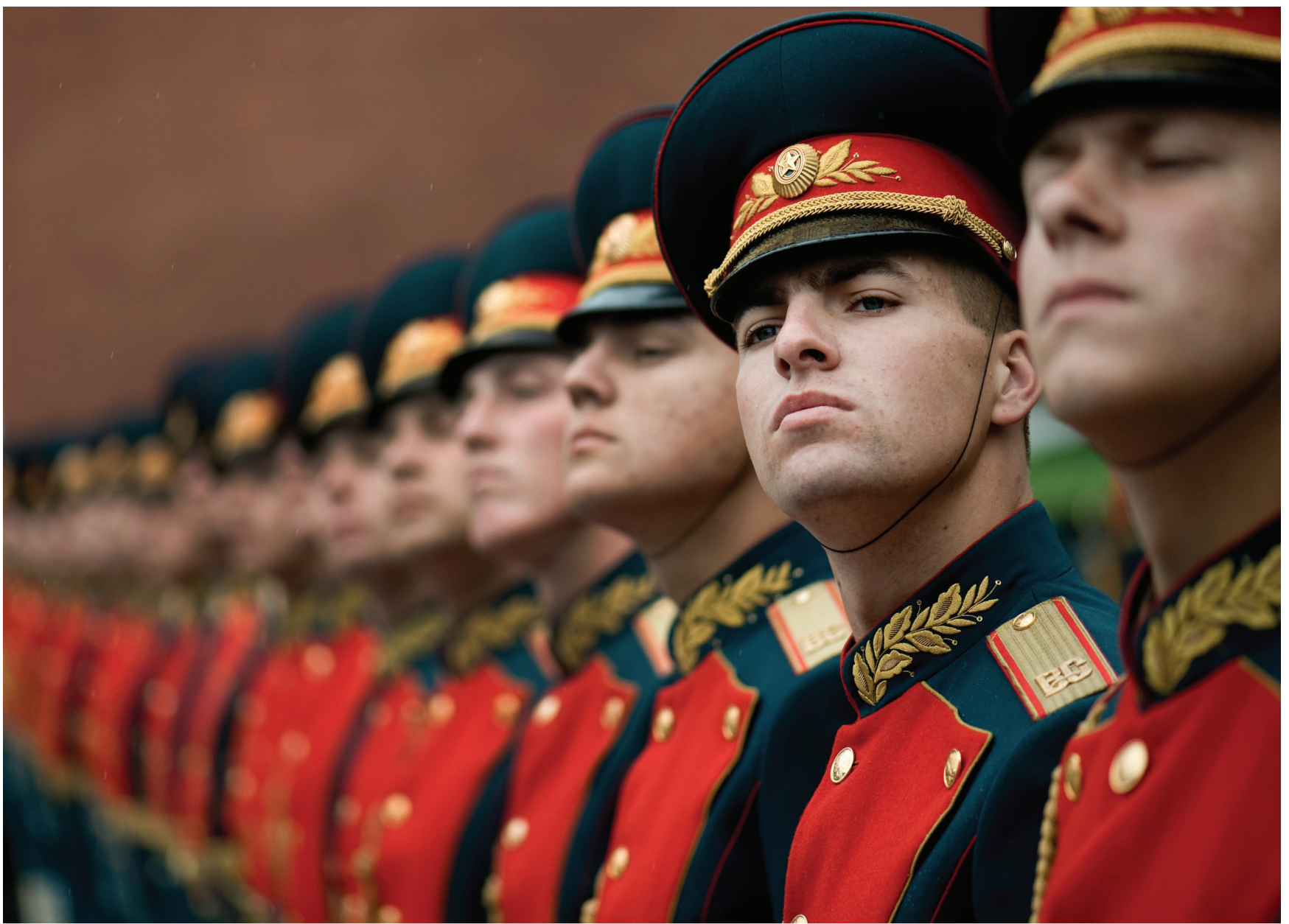
The Russian military honor guard welcomes U.S. Navy Adm. Mike Mullen, chairman of the Joint Chiefs of Staff, during a wreath-laying ceremony at the Tomb of the Unknown Soldier in Moscow, Russia, June 26, 2009.