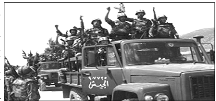
Kofi Annan pawhin nimin zing dar 6 atang khan Syria ram hmun hrang hranga sipaite hmalakna tihtawp a nih tur thu chhuahna thleng titawp tura hma la turin an nawr reng bawk.

Syria Defence Ministry chuan nimin atang khan sorkar paihthlak tuma helte sipai chakna hmanga beih thin chu tihtawp a ni tih a sawi.