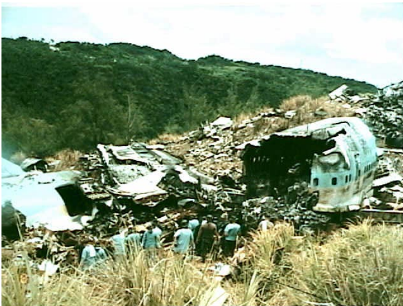
Survival Factors 6 - Photo 4. View of center fuselage section (Note: the interior cabin is destroyed by fire)