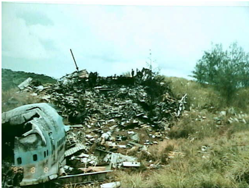
Survival Factors 6 - Photo 5. View of the destroyed forward fuselage (Note: arrow points to one of the airplanes forward galley partitions)