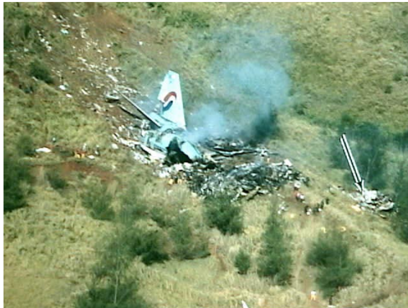
Survival Factors 6 - Photo 2. Aerial view of accident site (The arrow points to the nose of the airplane)