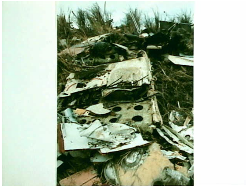
Survival Factors 6 - Photo 7. View of the R1 door Note: double flight attendant seats in background