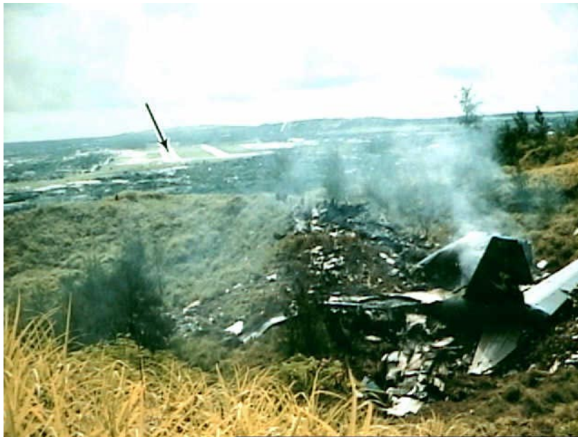
Survival Factors 6 - Photo 1. View of accident site looking North-East toward Guam International Airport (GIA) (Note: Arrow points to GIA runway 06)