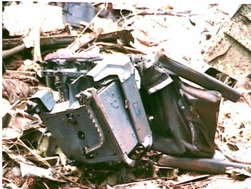
Survival Factors 6 - Photo 8. View of the First Officer's Seat