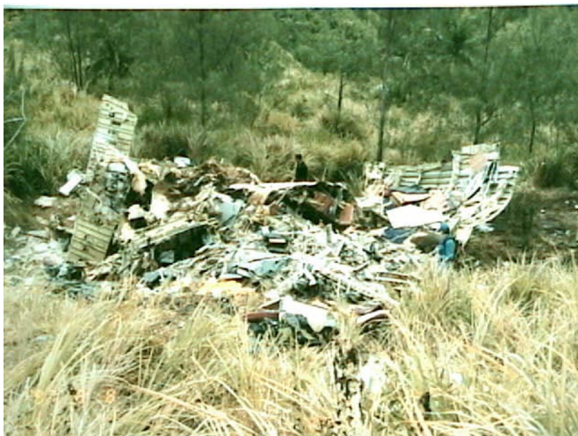
Survival Factors 6 - Photo 6. View of the cockpit and First class section of the airplane.