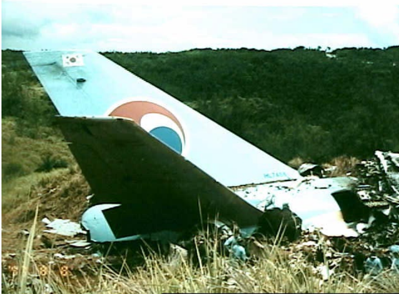
Survival Factors 6 - Photo 3. View of the separated tail section of KAL Flight 801