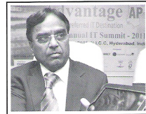
Minister for Information Technology and Communications at work