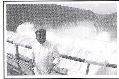
Releasing water from Srisailem Irrigation Dam