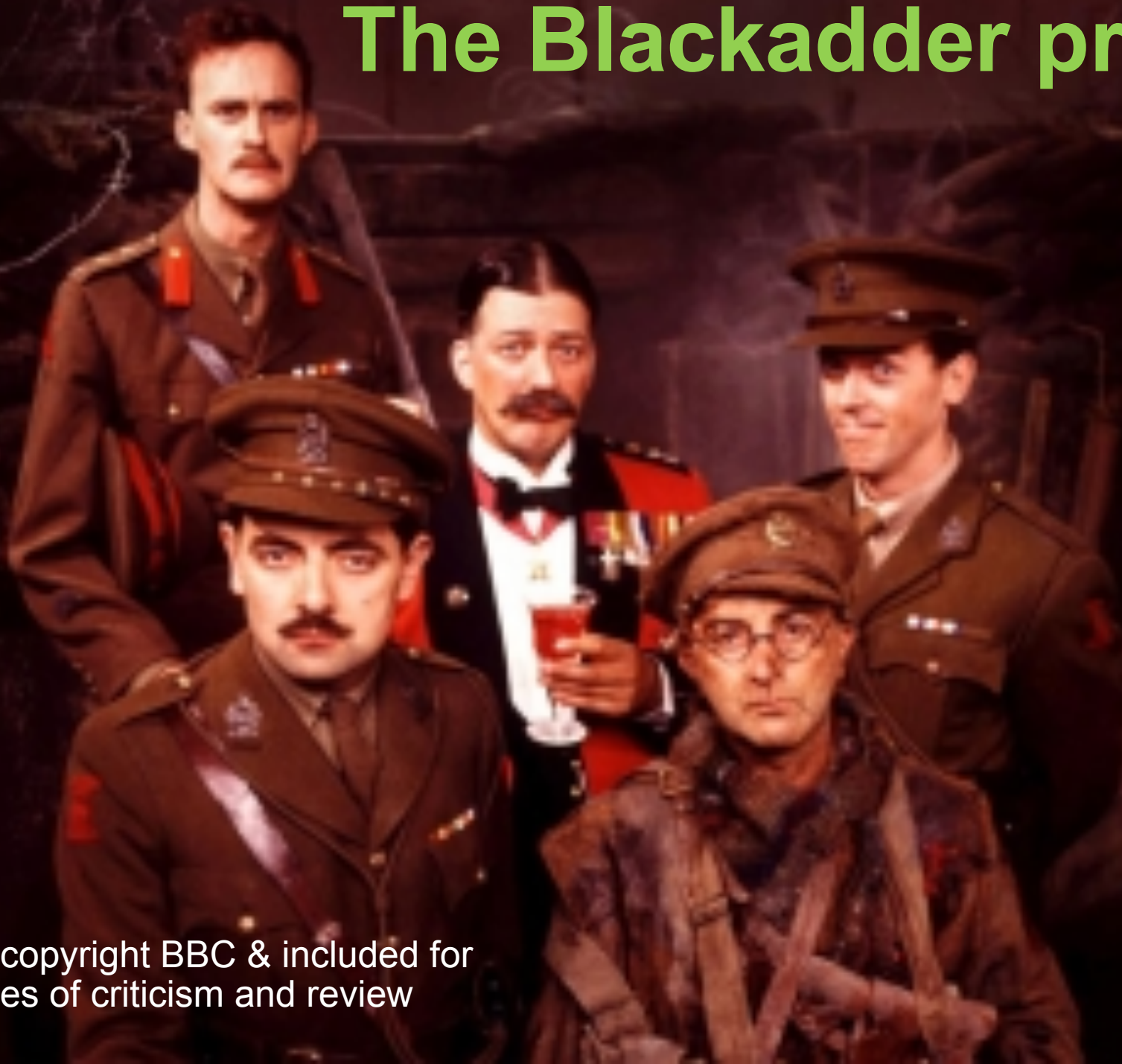
Image copyright BBC & included for purposes of criticism and review