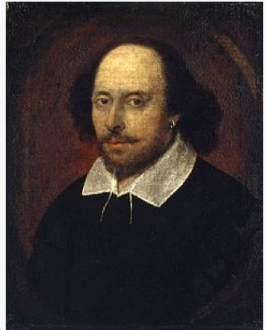
The Chandos portrait , artist and authenticity