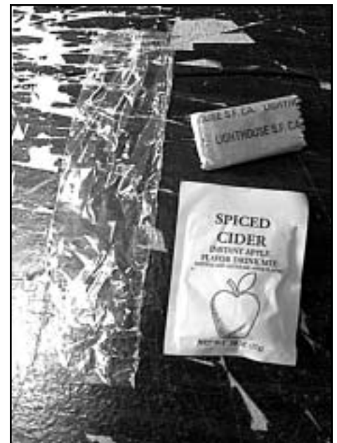
Once the plastic spoon bag, toilet paper and spiced cider is removed from the MRE, it is considered fully sanitized and can be served to the detainees.