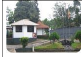
Kuruwita Tire Division Established: 2003