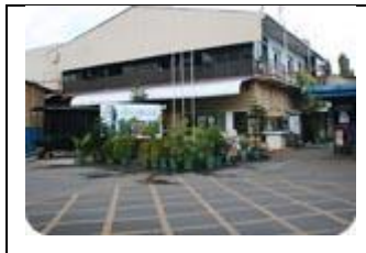
Ekala Tire Division Established: 1994

Presently the company consumes a significant percentage of the natural rubber production of Sri Lanka. Loadstar has continued to grow rapidly over the last 27 years and is continuing its journey with implementation of lean system and processes.