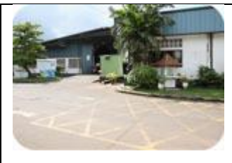
Jinasena Industrial Park Established: 1996