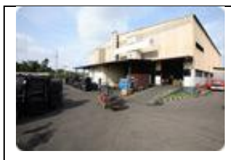
Central Mixing Plant Established: 1999