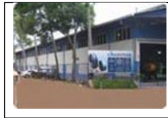
Ekala Tire Division 2 Established: 2008