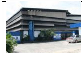
Ancillary Product Division Established: 2004