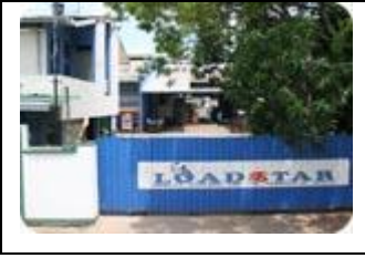
Kyoto Metal Products Division Established: 2003