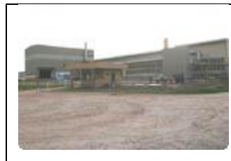
Cast Product Division Established: 2007

Above those plants & offices owned by loadstar . In those I trained at Jinasena Industrial Park in ekala (JIP). In JIP they doing all services of their other factories and design & install all production machineries .there are machine shop ,hydraulic shop , electrical shop heavy machinery shop as EMD 01,02,03,08 etc. there are one factory manager and each main division have engineering manager and also specify engineer for the familiar subject of the division.