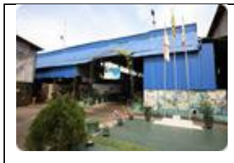
Ekala Metal Product Division Established: 2004