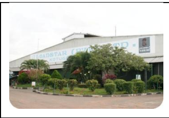
Kotugoda Tire Division Established: 1992