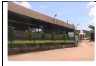
Midigama Tire Division Established: 1998