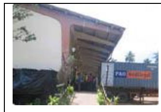
Palena Stores Complex Established: 2005