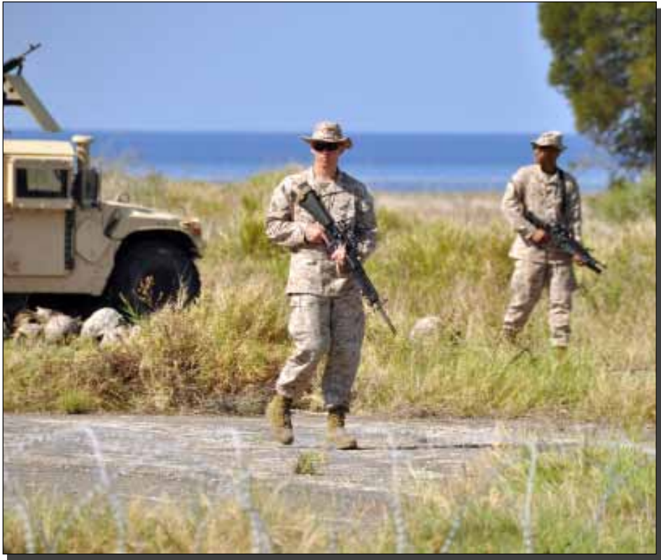
Marines assigned to 3rd Platoon, Alpha Company, Fleet Anti-terrorism Security Team (FAST), who are deployed to Guantanamo Bay from Norfolk, Va., practice patrols during pre-deployment training at McCalla Field on April 12. FAST platoons spend three months in Guantanamo Bay, alternating between monitoring the base’s perimeter fence and training for forward-deployed life in areas of interest worldwide.