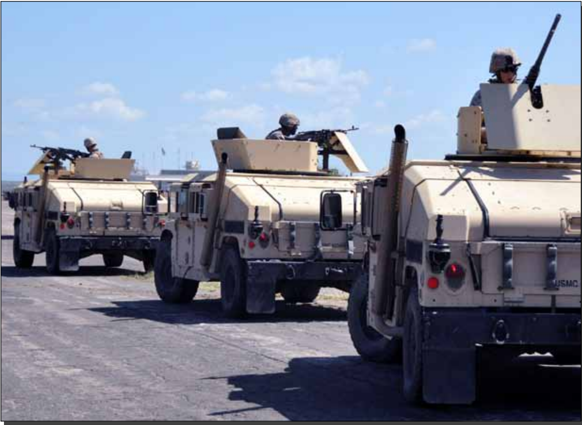
Marines assigned to 3rd Platoon, Alpha Company, Fleet Anti-terrorism Security Team (FAST), who are deployed to Guantanamo Bay from Norfolk, Va., convoy operations during pre-deployment training at McCalla Field on April 12.