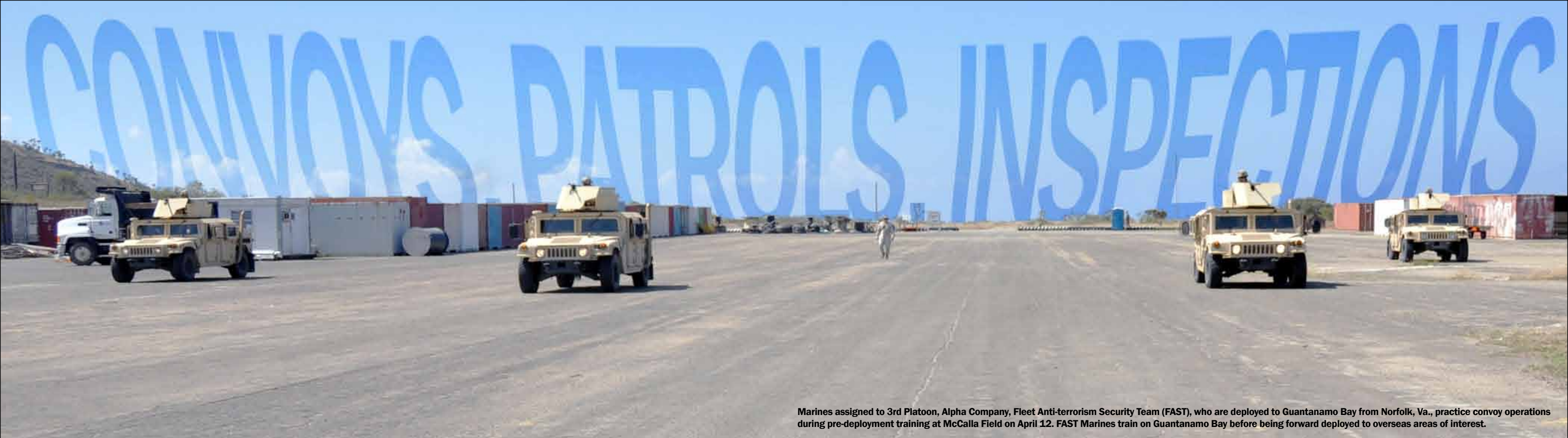
Marines assigned to 3rd Platoon, Alpha Company, Fleet Anti-terrorism Security Team (FAST), who are deployed to Guantanamo Bay from Norfolk, Va., practice convoy operations during pre-deployment training at McCalla Field on April 12. FAST Marines train on Guantanamo Bay before being forward deployed to overseas areas of interest.