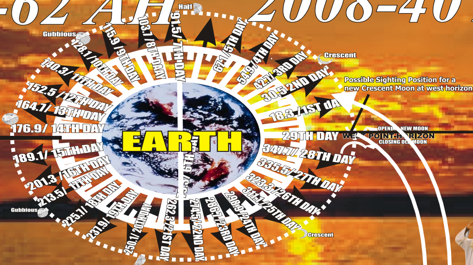
Positions for 29 Days of Lunar Phases