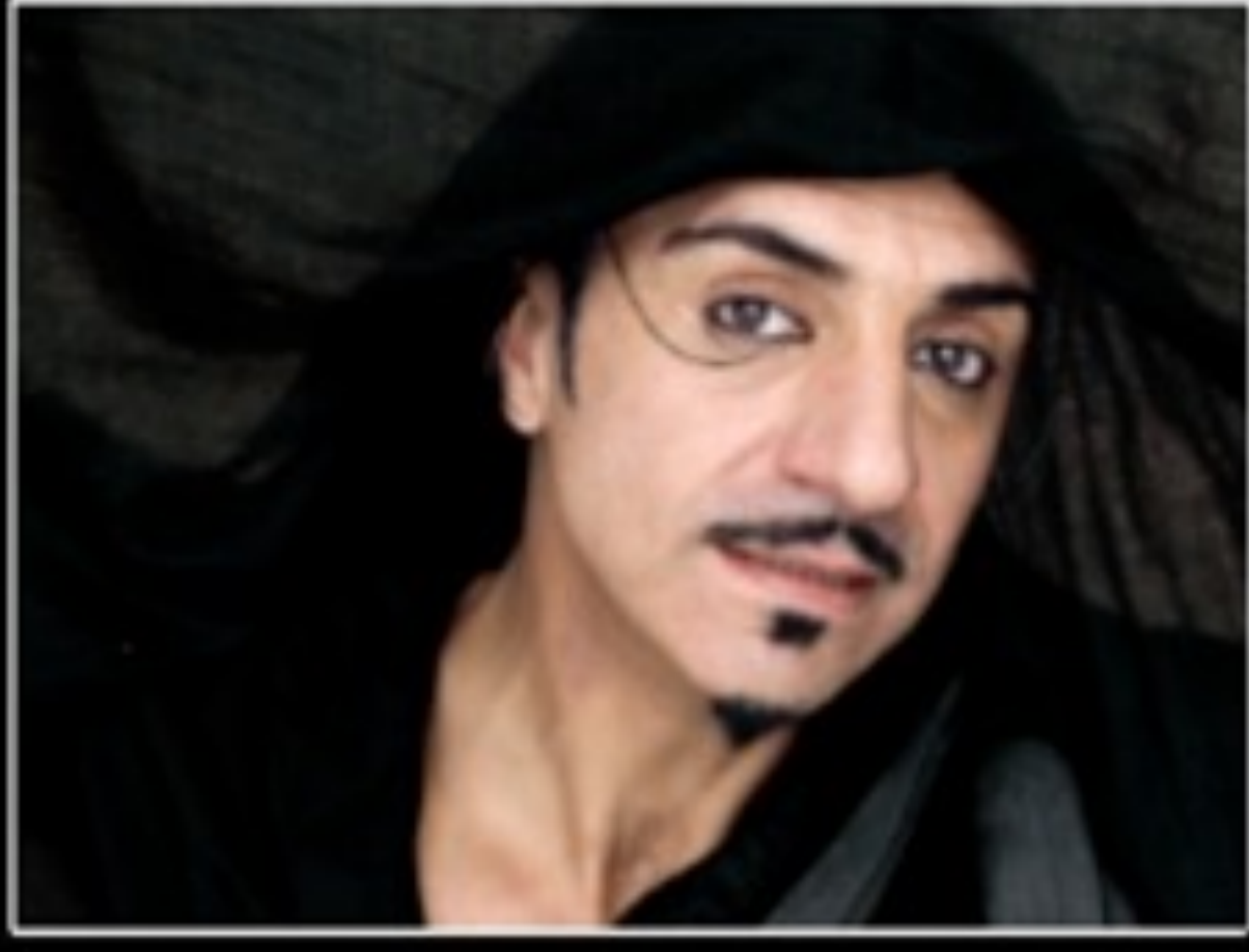
Simon Abkarian MERLIN