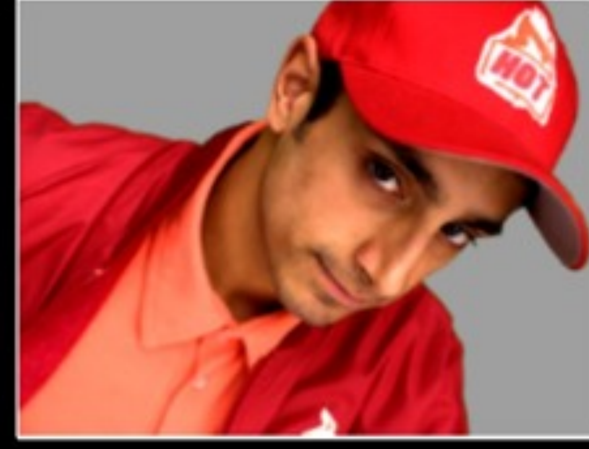
Riz Ahmed VIJAY