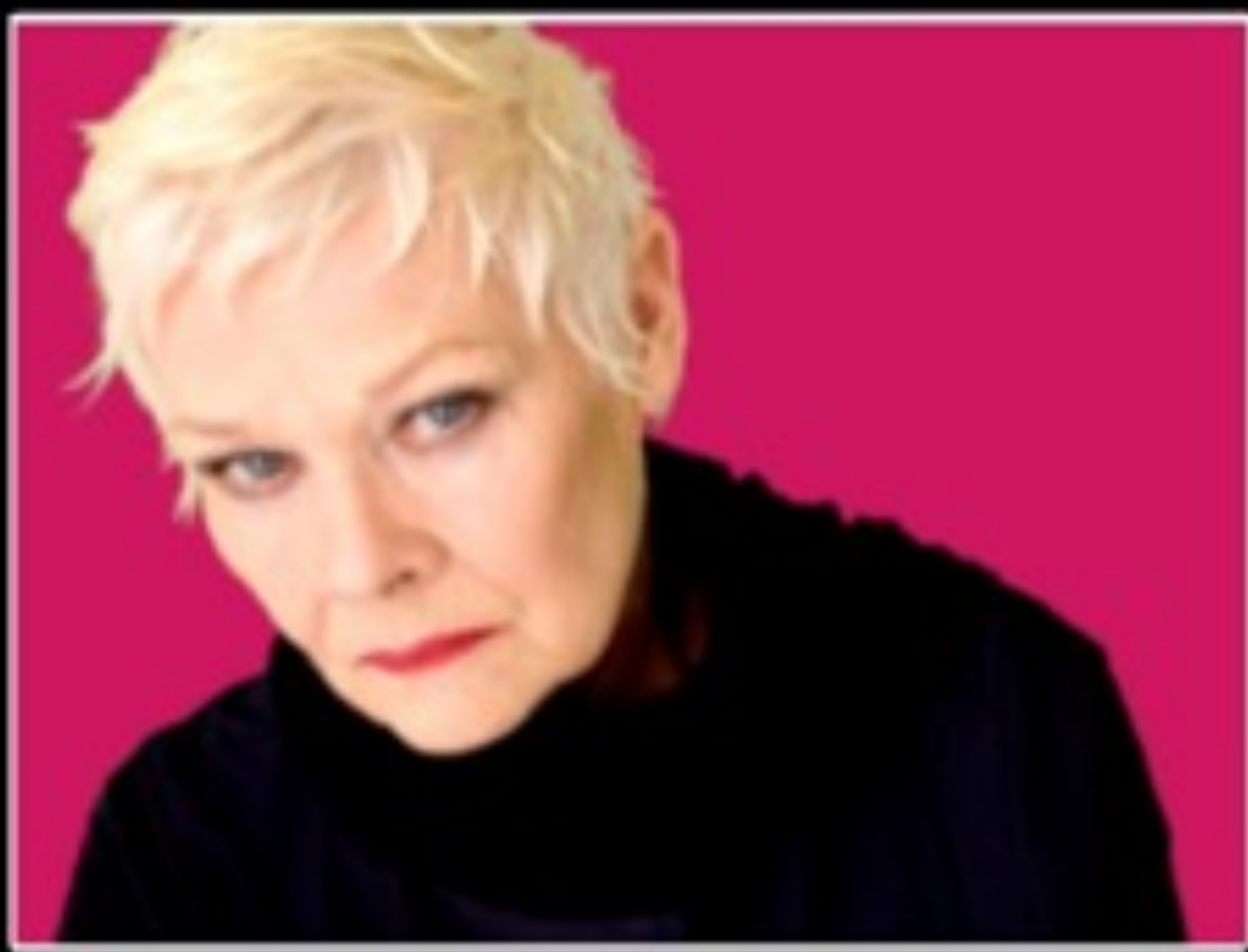
Judi Dench