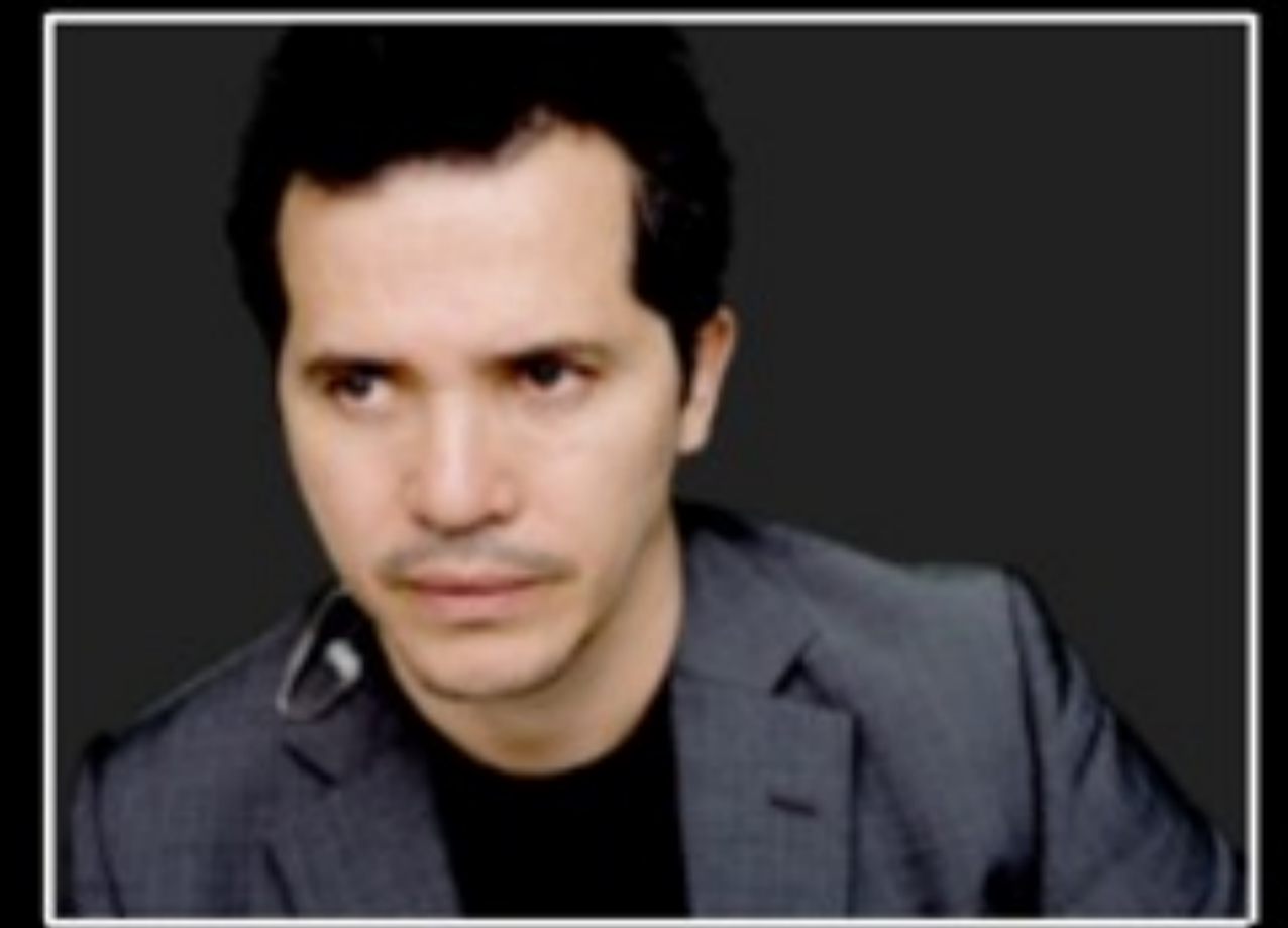
John Leguizamo JED