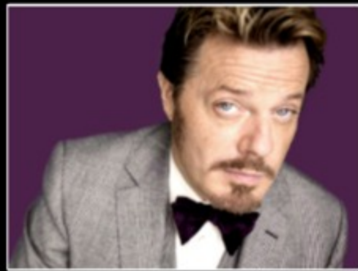
Eddie Izzard TINY DIAMONDS