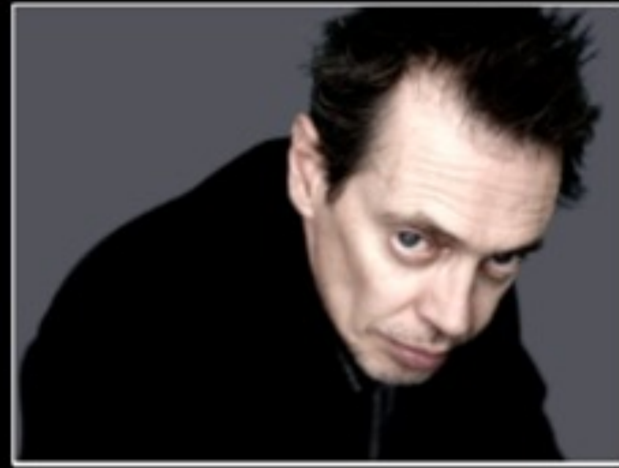
Steve Buscemi FRANK