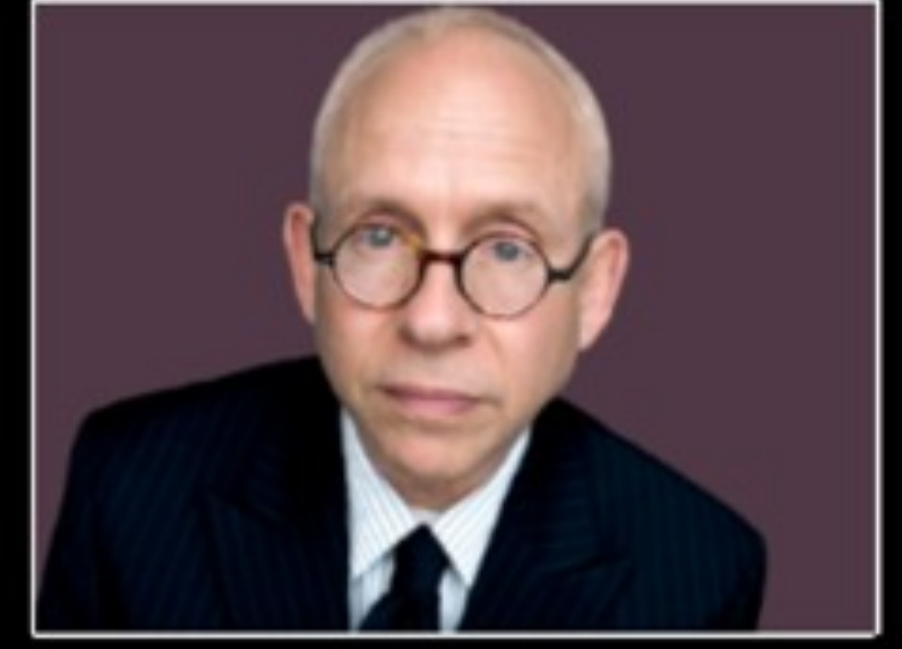
Bob Balaban MR. WHITE