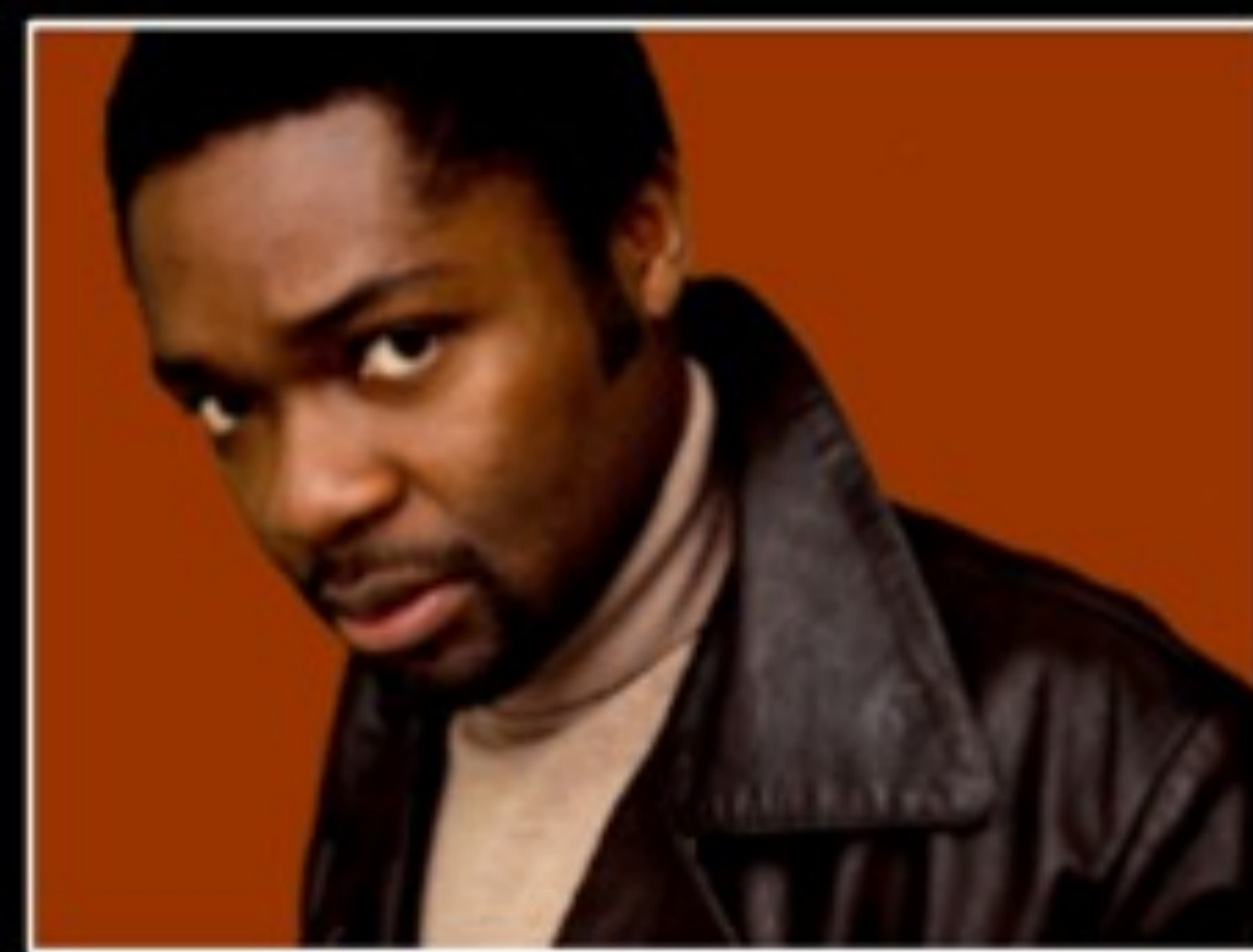
David Oyelowo HOMER