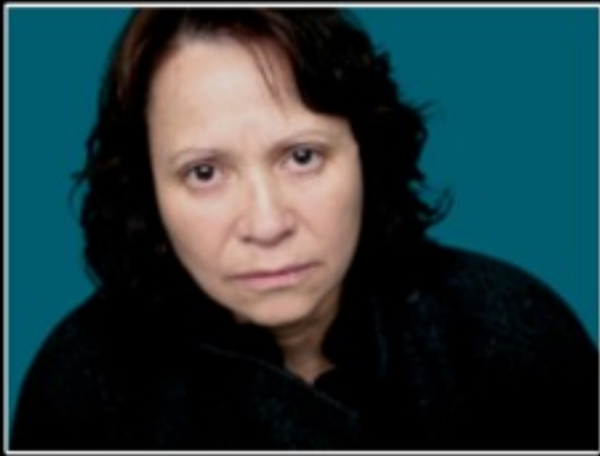
Adriana Barraza ANITA DE LOS ANGELES