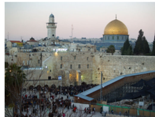
Jerusalem: the future of the city, claimed by both sides in the conflict, will be key to any final settlement

The draft statement comes amid ongoing expansion of Israeli settlements on occupied Palestinian land under the current right-wing government of Benjamin Nentanyahu, in a process creating facts on the ground which are likely to complicate a two-state solution.