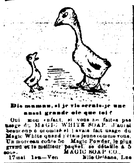
Die mamme, el je vis arantje une annee grande ele que toi?

Qui mon enfant, el vous ne faites pas usage de MAGIC WHITE SOAP? J'ai vu Magic White quand j'étais jeune et comme vous. Un morceau coûte 5c. Magic Powder le plus grand et le meilleur. Se détaillera à 5c. 17ma1 1m-Ven. Nlle-Orleans, Lae